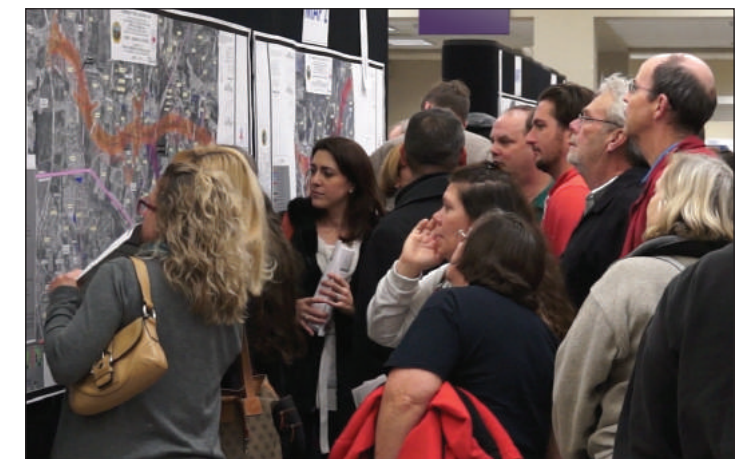
More than 1,000 individuals attended the three public meetings and one public hearing held this past December.

Si desea recibir una copia de este boletín en Español, por favor llame al número de teléfono 1-800-481-6494, o envíe un correo electrónico a complete540@ncdot.gov .