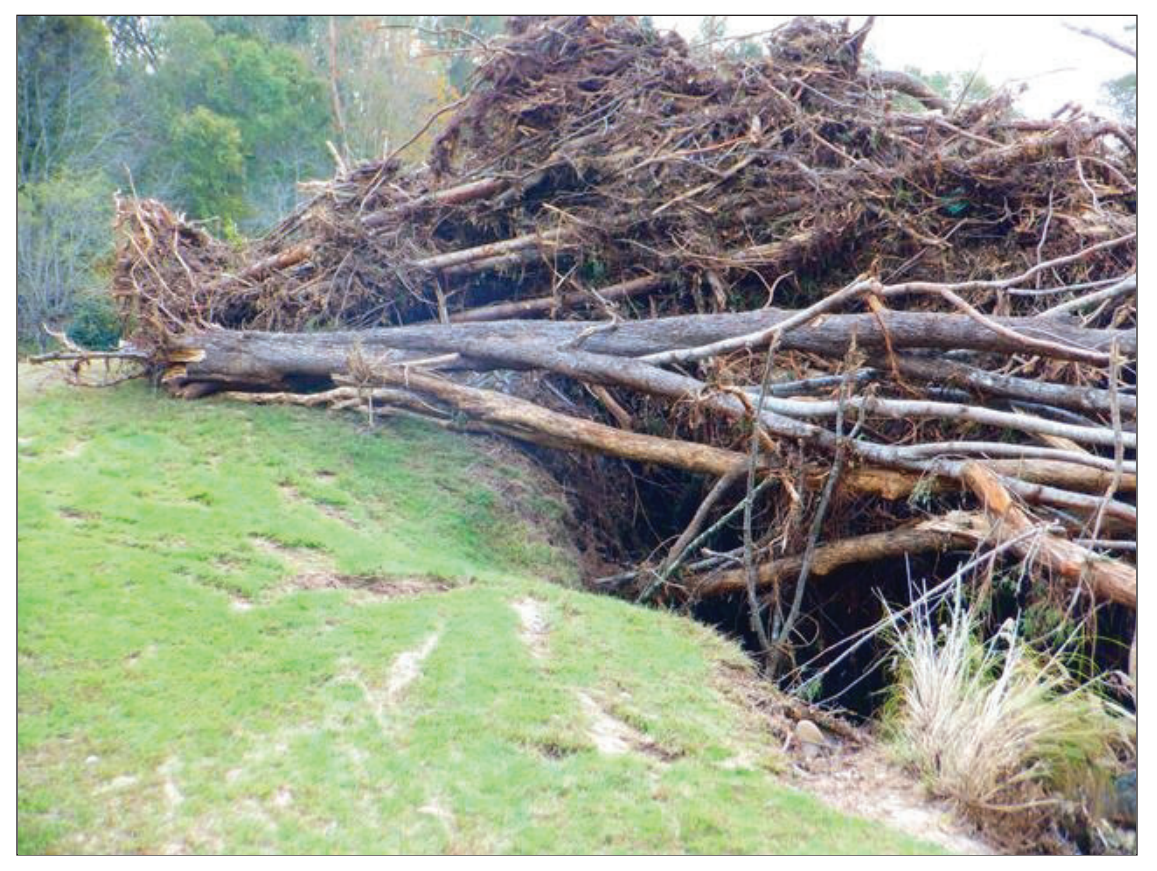
SPAN 1 DRIFT. (PAR)