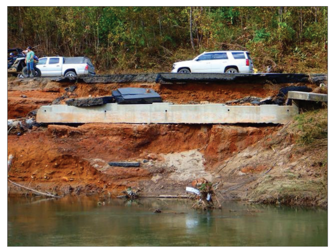
BRIDGE CLOSED. END BENT 2. COULD NOT ACCESS. (PAR)

END BENT 1 HAS FAILED. EXPOSED PILES. CAP HAS WIDE CRACKS AND SPALLED AREAS. (PAR)