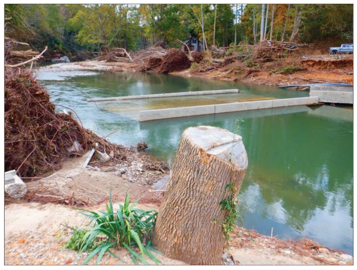
SPAN 2 AND SPAN 3 FAILED. SPANS ARE DOWNSTREAM. (PAR)