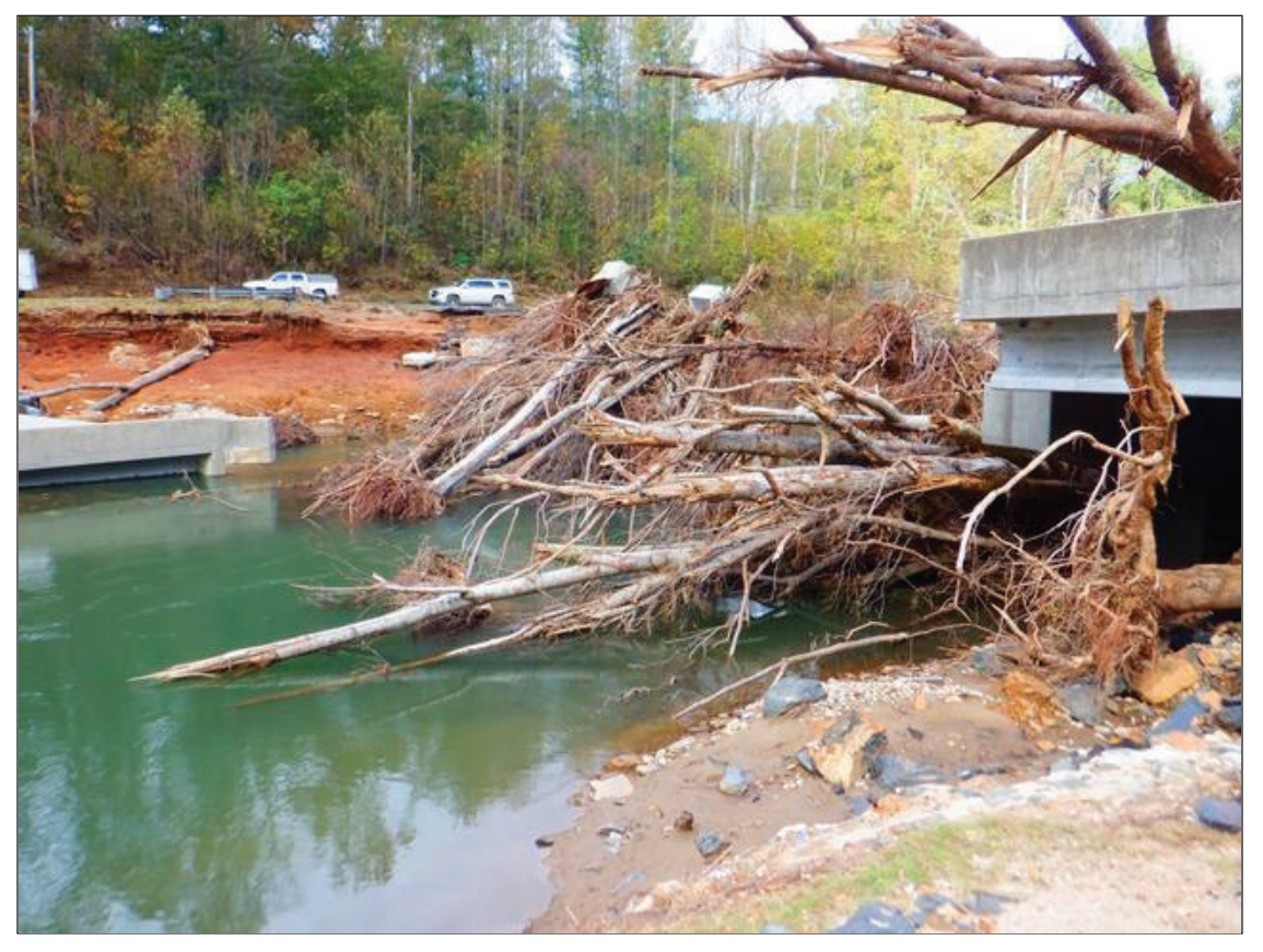
SPAN 2 AND SPAN 3 FAILED. SPANS ARE DOWNSTREAM. (PAR)