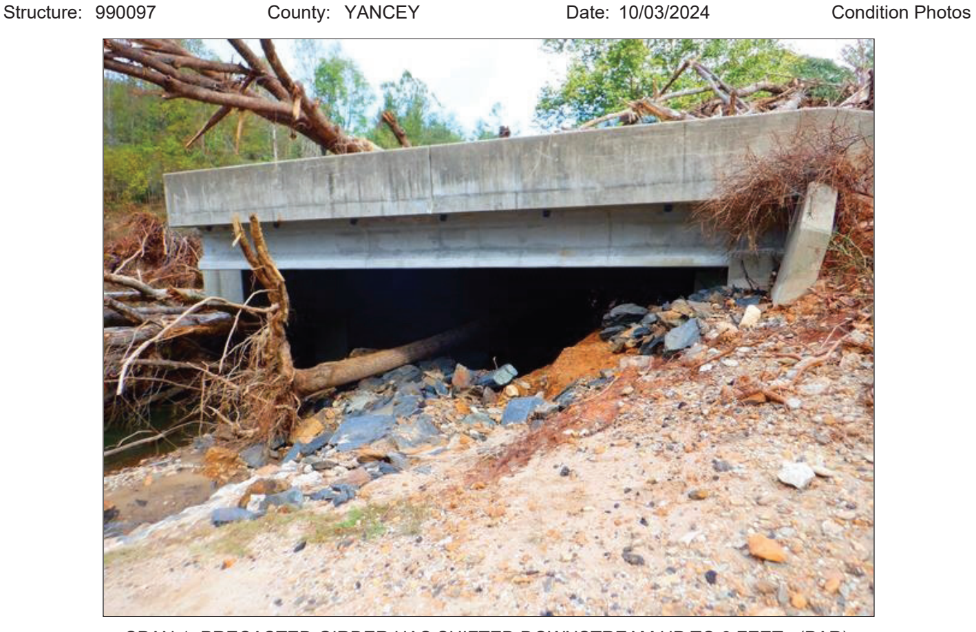
SPAN 1: PRECASTED GIRDER HAS SHIFTED DOWNSTREAM UP TO 2 FEET. (PAR)