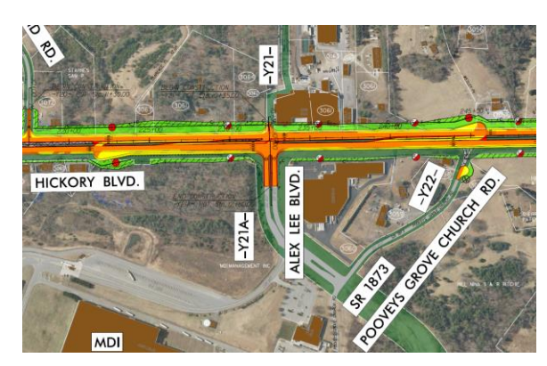
Figure 12: Superstreet design, July 2016 public hearing

NOTE: Alternative bolded and italicized is recommended by NCDOT