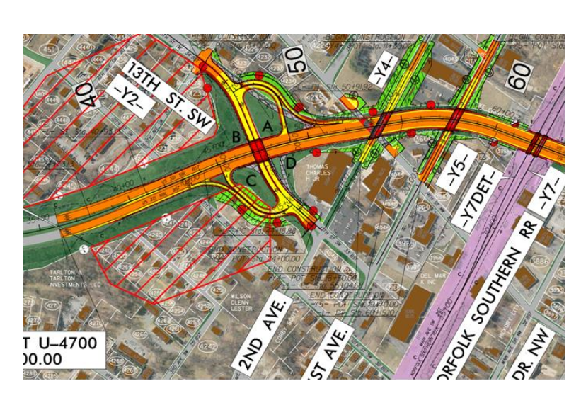
Figure 1: 13th Street SW interchange design, July 2016 public hearing

NOTE: Alternative bolded and italicized is recommended by NCDOT