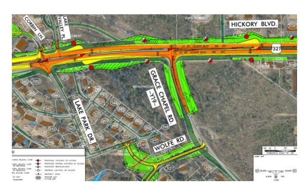
Figure 9: Superstreet design added to alternatives, July 2017 public meeting (plus Wolfe Rd connector)