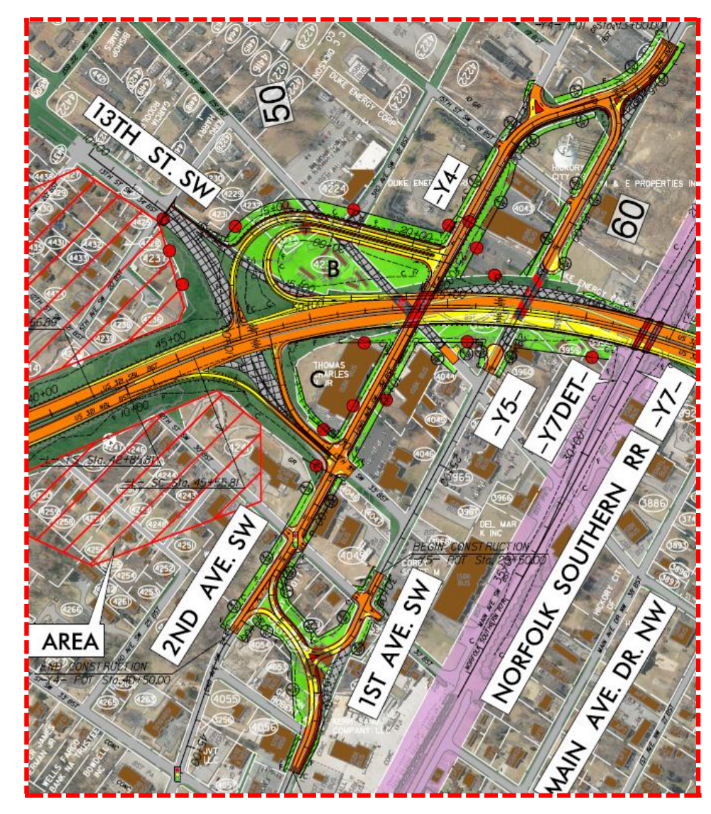
Figure 3: (Recommended) 2nd Avenue SW interchange design, January 2018