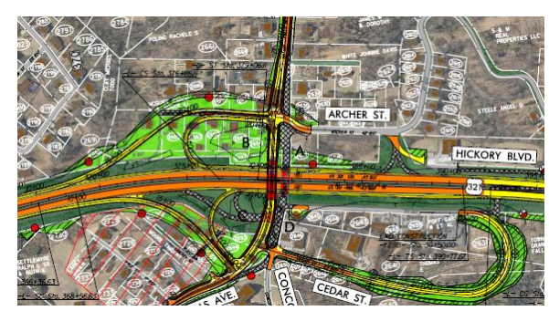
Figure 16: Partial cloverleaf alternative for Falls Avenue intersection presented at July 2016 public hearing

NOTE: Alternative bolded and italicized is recommended by NCDOT