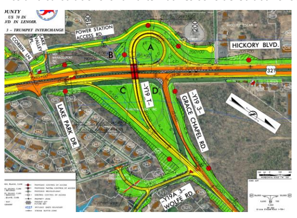
Figure 6: Trumpet interchange design, July 2016 public hearing (plus Wolfe Rd connector)