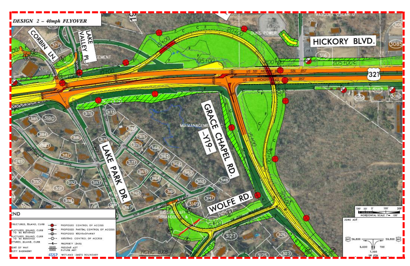
Figure 11: (Recommended) Revised flyover design, October 2017 public meeting with additional bridge over stream and increased slopes

U-4700 US 321 Widening C.P. 3 Merger – Alternatives Memo