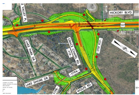
Figure 8: Flyover design, July 2016 public hearing (plus Wolfe Rd connector)