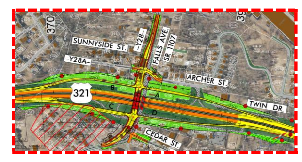
Figure 19: (Recommended)Tight diamond interchange design, January 2018