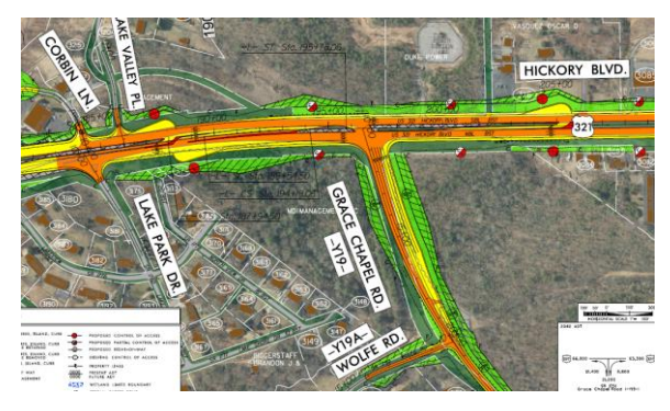
Figure 7: Reverse Superstreet intersection design, July 2016 public hearing