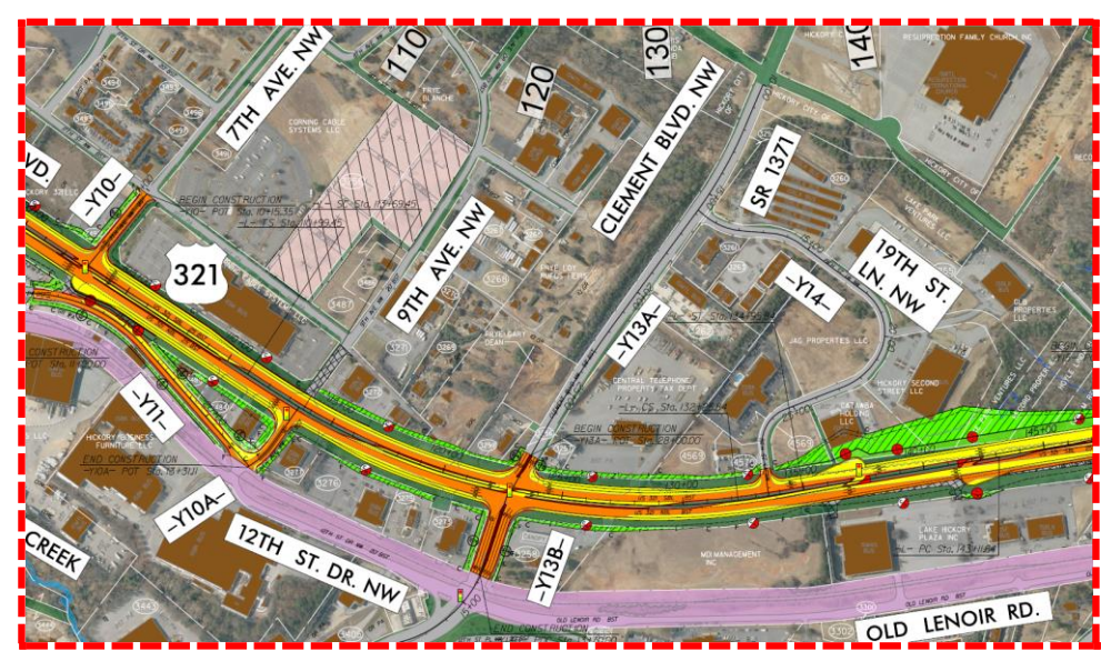
Figure 5: (Recommended) Superstreet intersection design, July and October 2017 public meetings