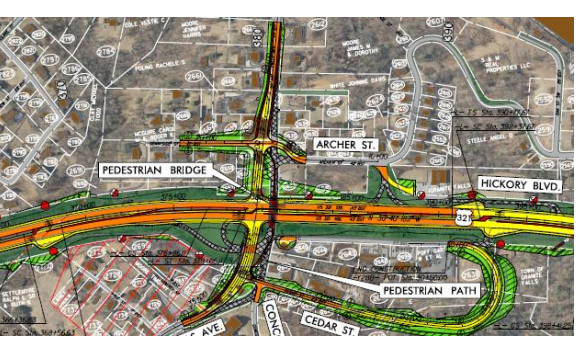
Figure 17: Superstreet alternative for Falls Avenue intersection presented at July 2016 public hearing