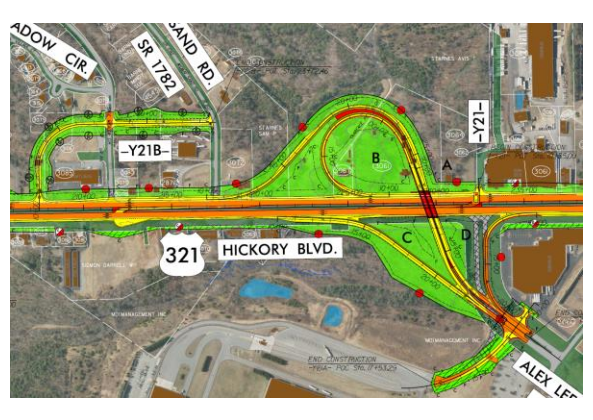
Figure 13: Trumpet interchange design, July 2017 public meeting