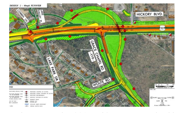
Figure 10: Revised flyover design, October 2017 public meeting with additional bridge over stream