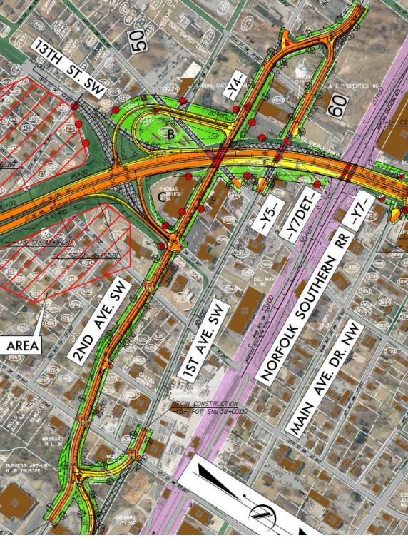
Figure 2: 2<sup>nd</sup> Avenue SW interchange design, July and October 2017 public meetings