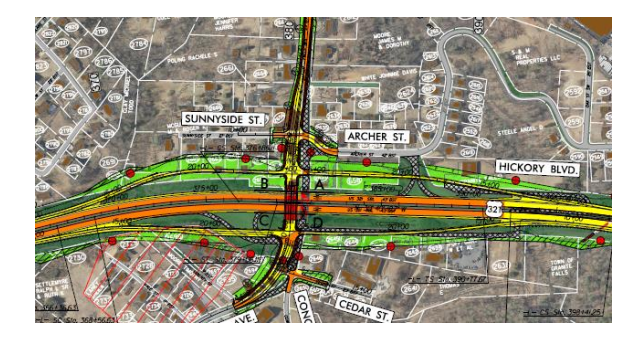
Figure 18: Tight diamond interchange design, July 2016 public hearing and October 2017 public meeting