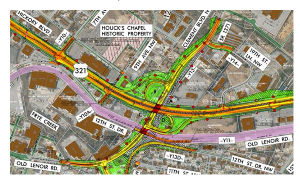
Figure 4: Half clover interchange design, July 2016 public hearing

NOTE: Alternative bolded and italicized is recommended by NCDOT