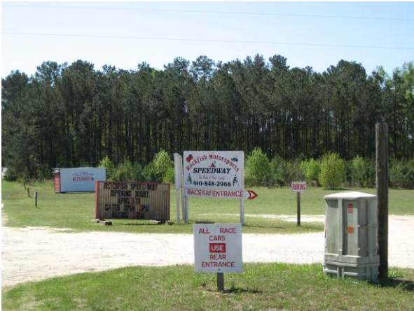
3- Rockfish Motorsports Speedway