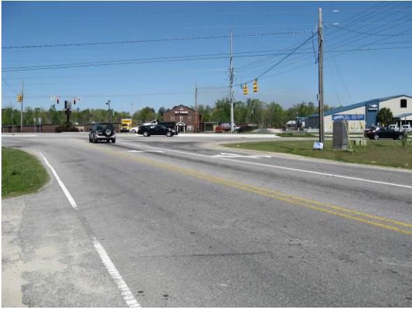
1- U.S. 401 (north) approach