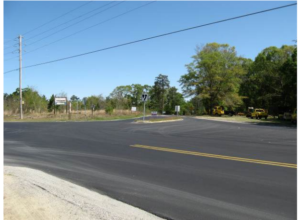
2- Intersection – Gillis Hill Road