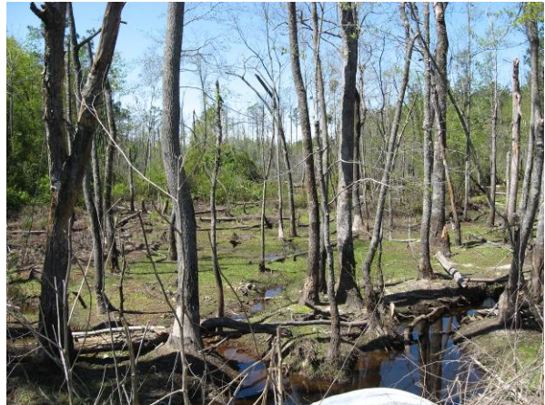
4- Wetlands near Stewart's Creek