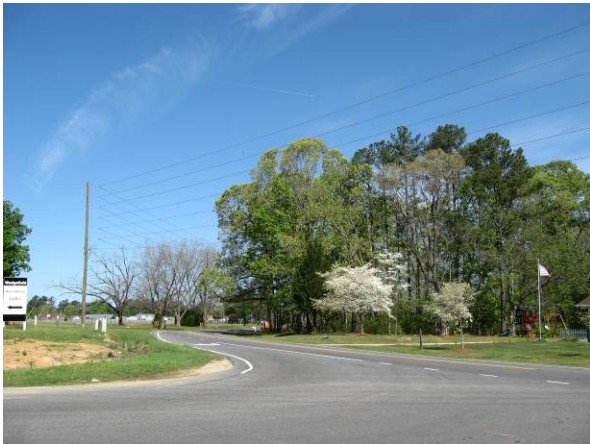
3- Intersection – Brock Road