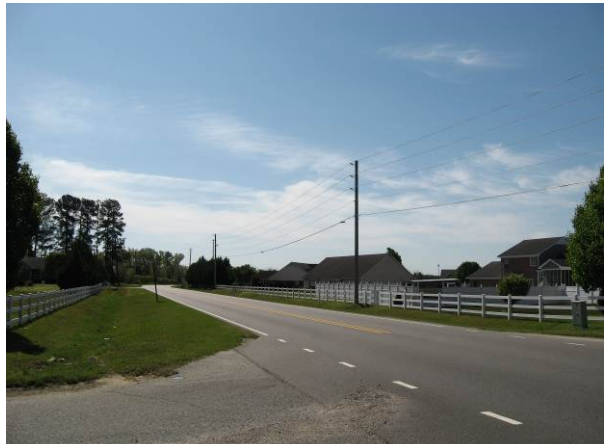
4- Residential neighborhood