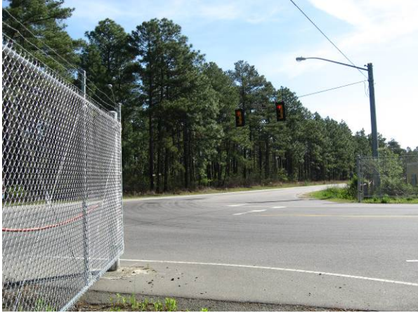
1- Plank Road approach