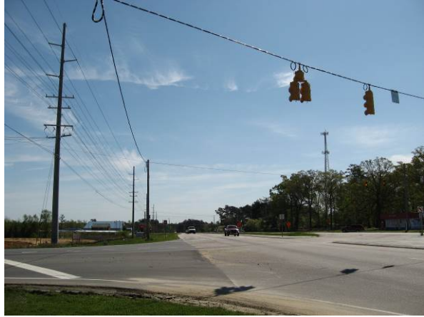
2- U.S. 401 (south) approach