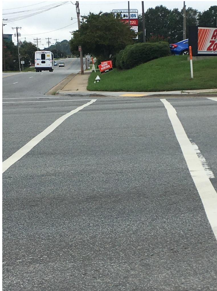
Photo 4: View looking west on north side of Meadowview Road from the intersection of S. Elm-Eugene Street and Meadowview Road.