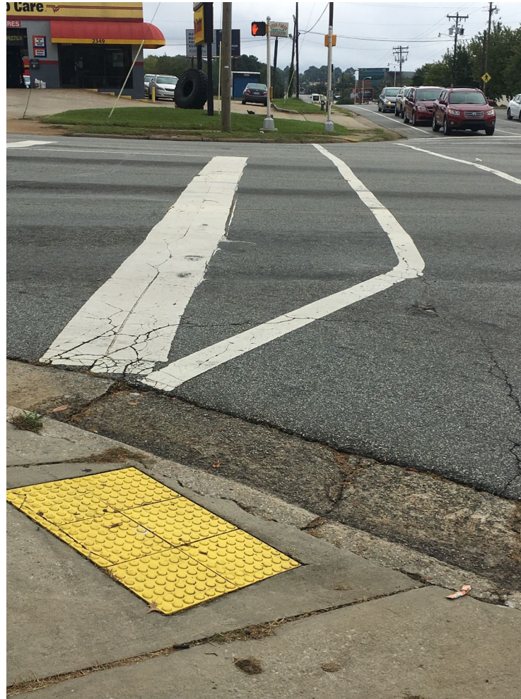
Photo 2: View looking east on north side of Meadowview Road from the intersection of Randleman Road and Meadowview Road.