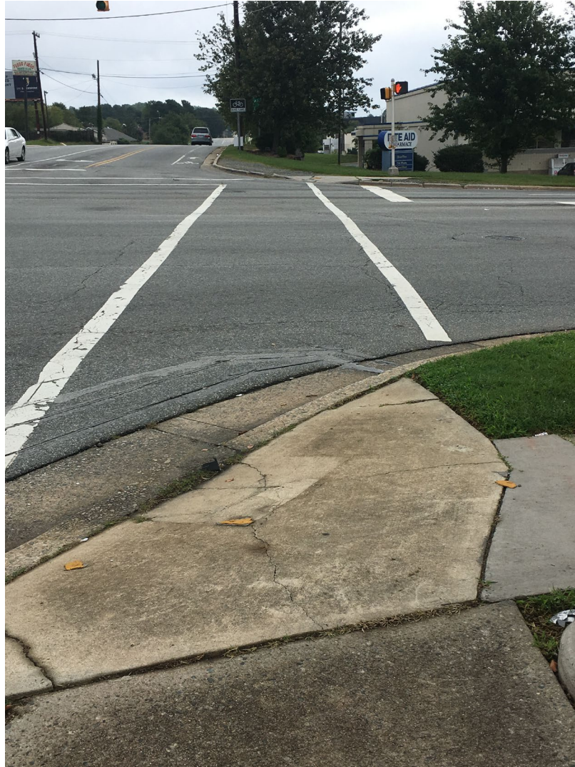
Photo 1: View looking east on south side of Meadowview Road from the intersection of Randleman Road and Meadowview Road.