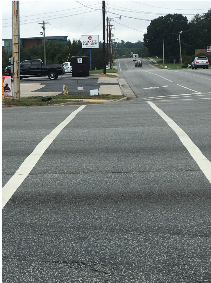
Photo 3: View looking west on south side of Meadowview Road from the intersection of S. Elm-Eugene Street and Meadowview Road.