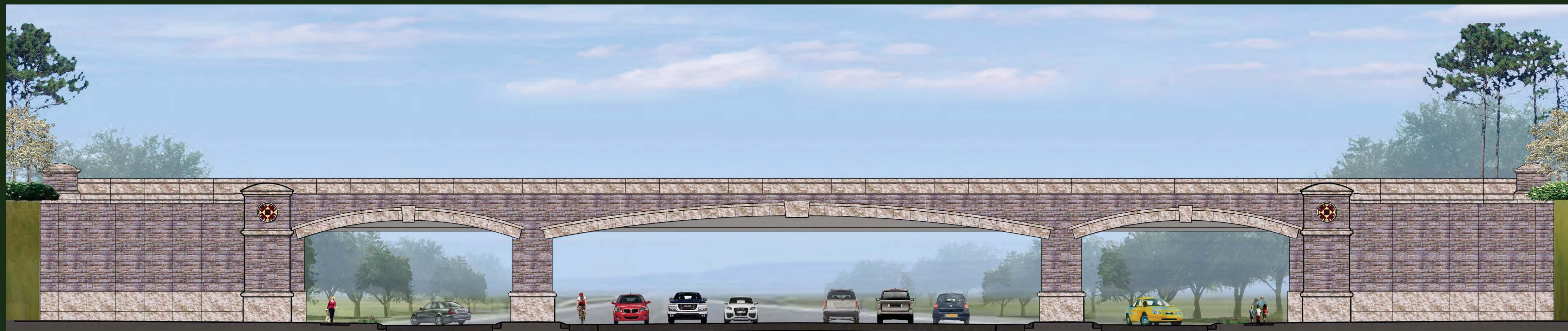
B - 4. Monroe Bypass Over Local Road w/ U-Turn