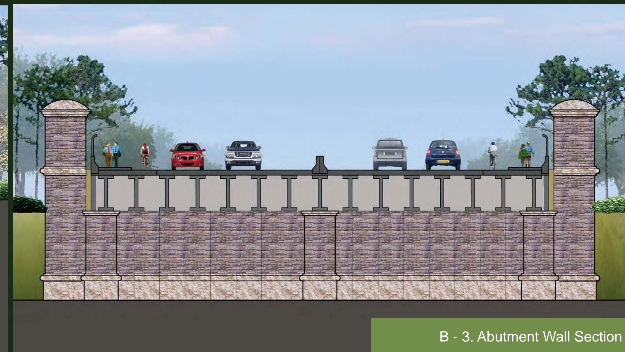
B - 3. Abutment Wall Section