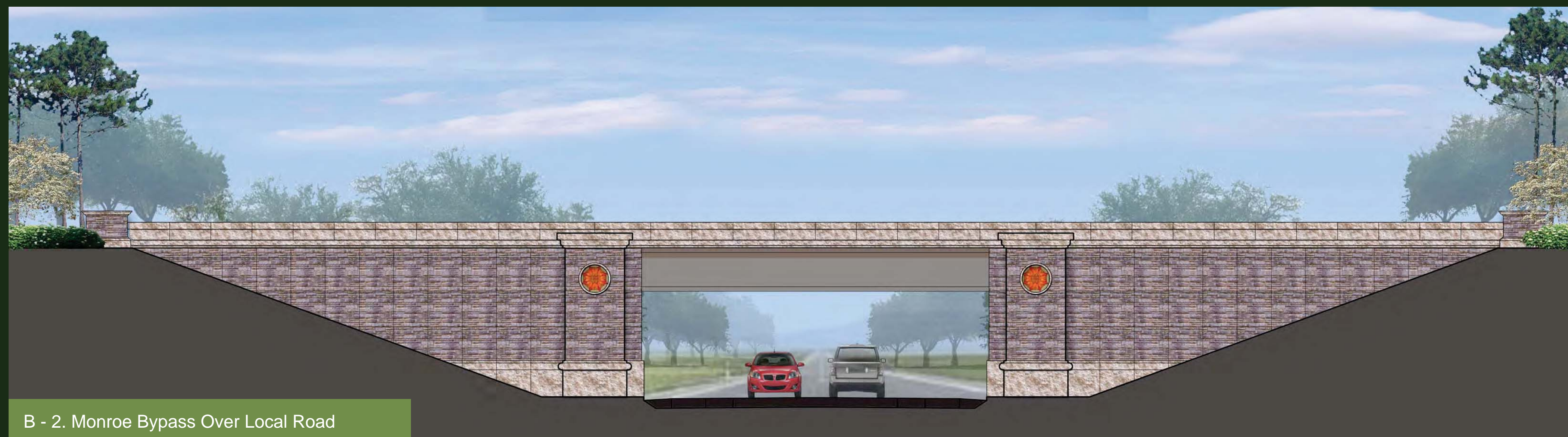
B - 2. Monroe Bypass Over Local Road