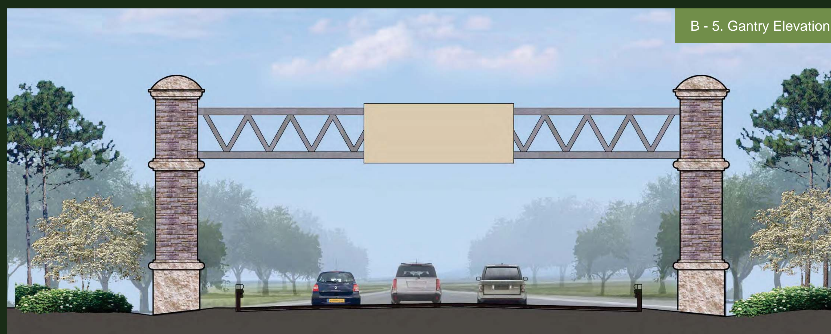
B - 5. Gantry Elevation