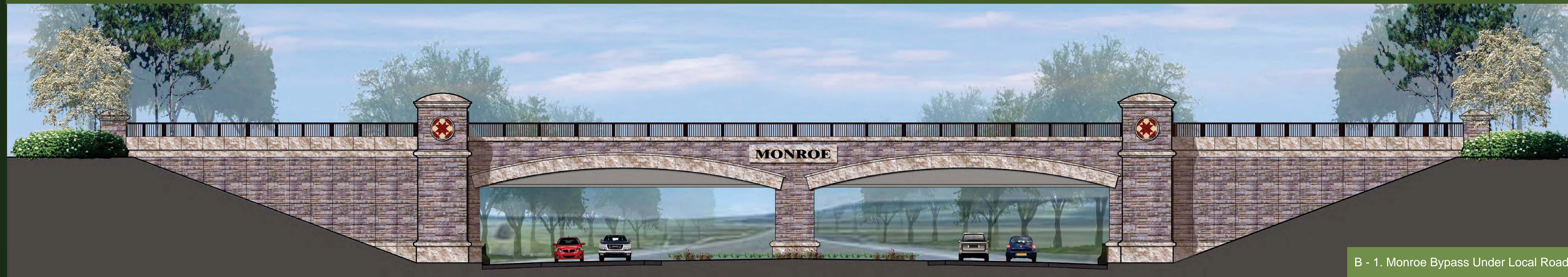
B - 1. Monroe Bypass Under Local Road