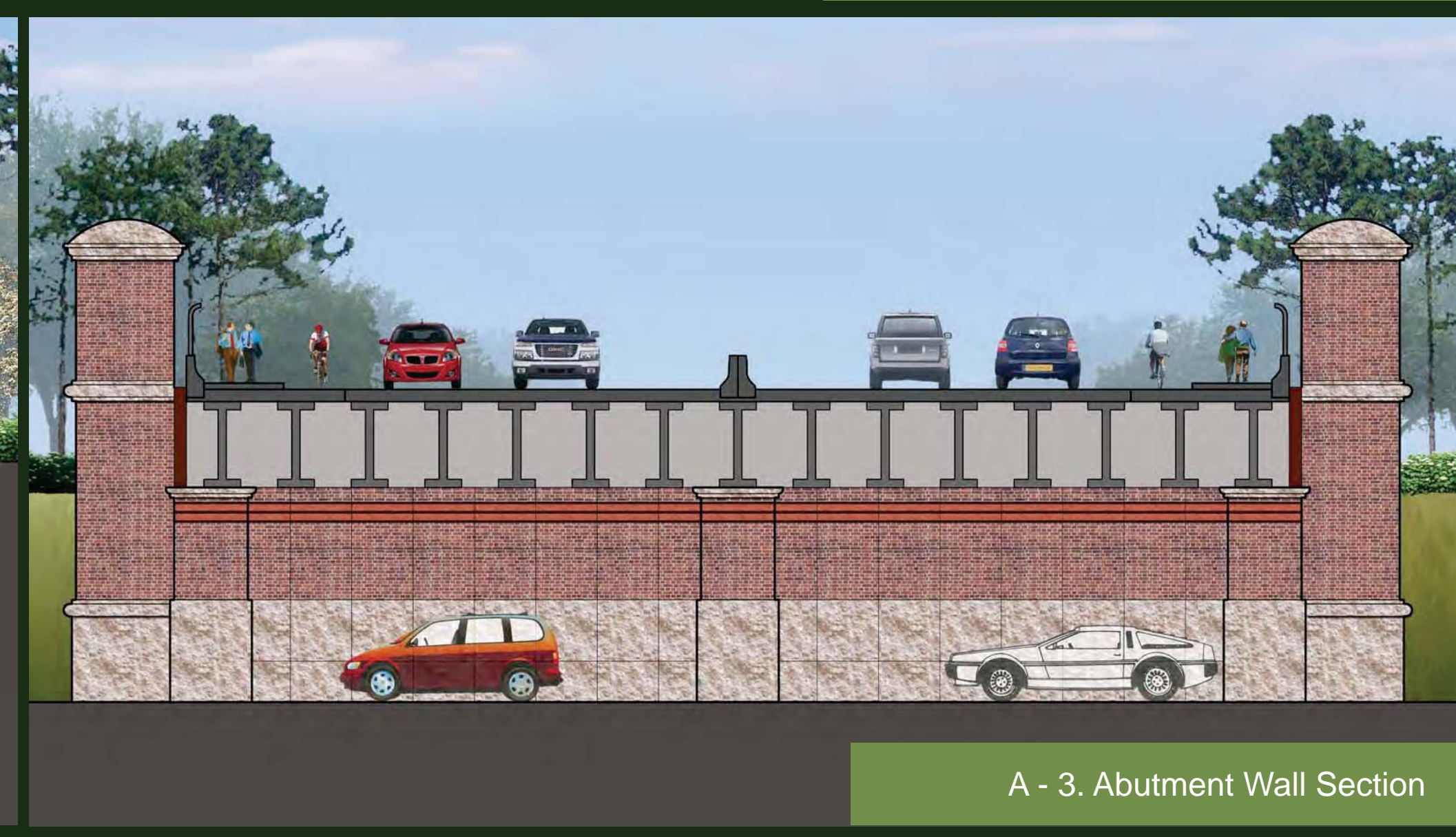
A - 3. Abutment Wall Section