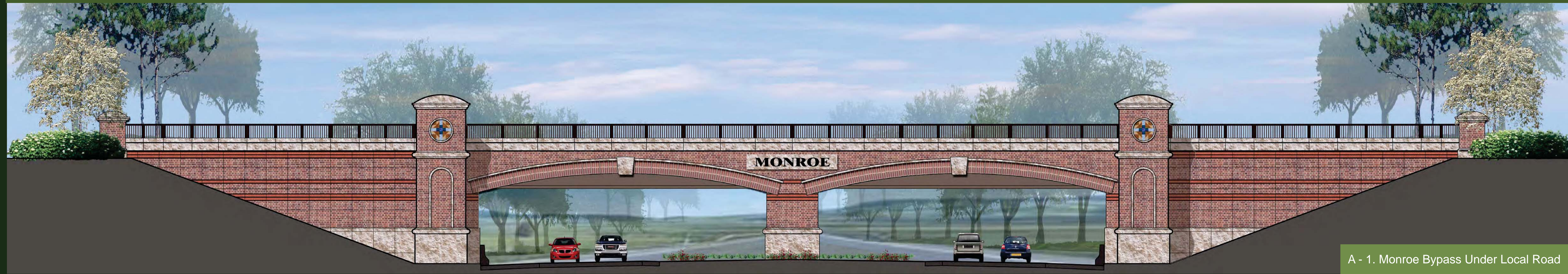
A - 1. Monroe Bypass Under Local Road