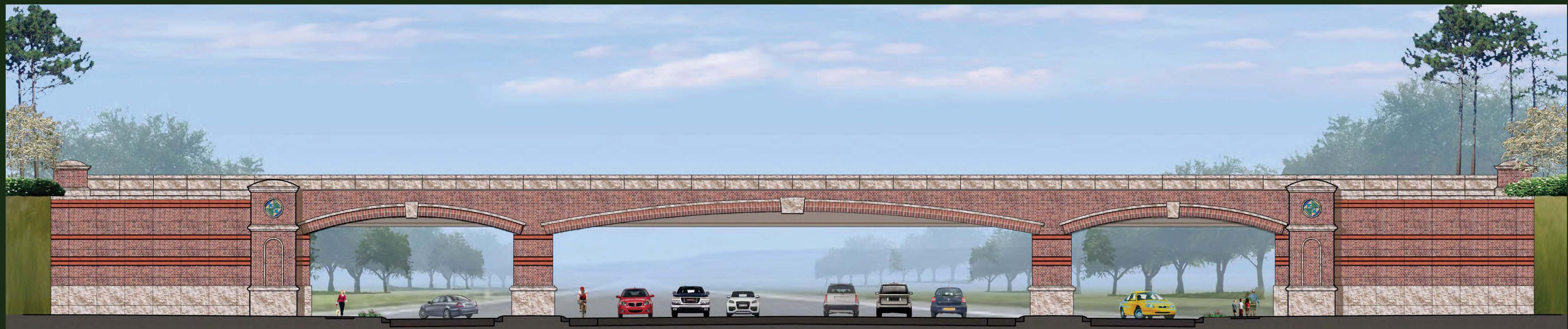
A - 4. Monroe Bypass Over Local Road w/ U-Turn