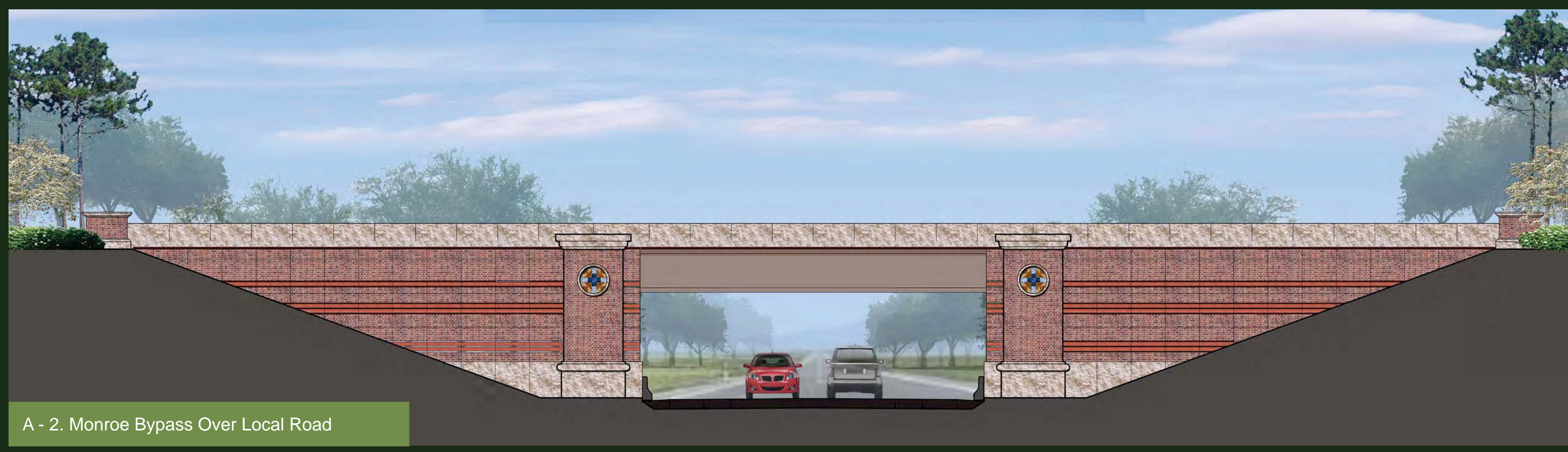
A - 2. Monroe Bypass Over Local Road