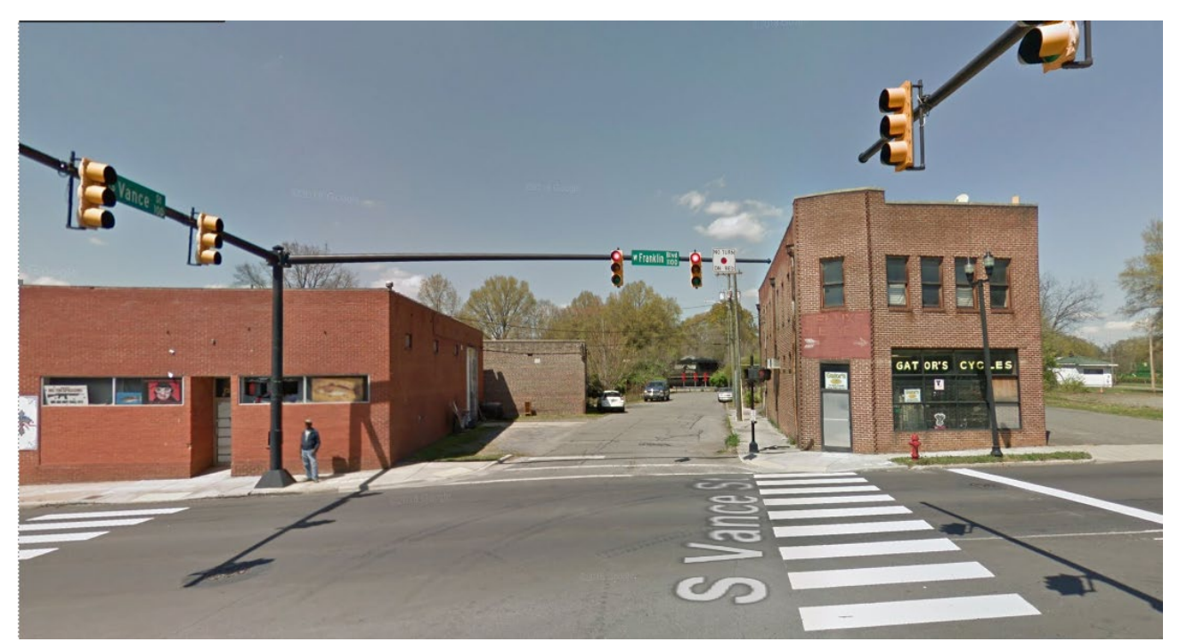
Loray Mill Historic District Corner of S. Vance St and W. Franklin Blvd.