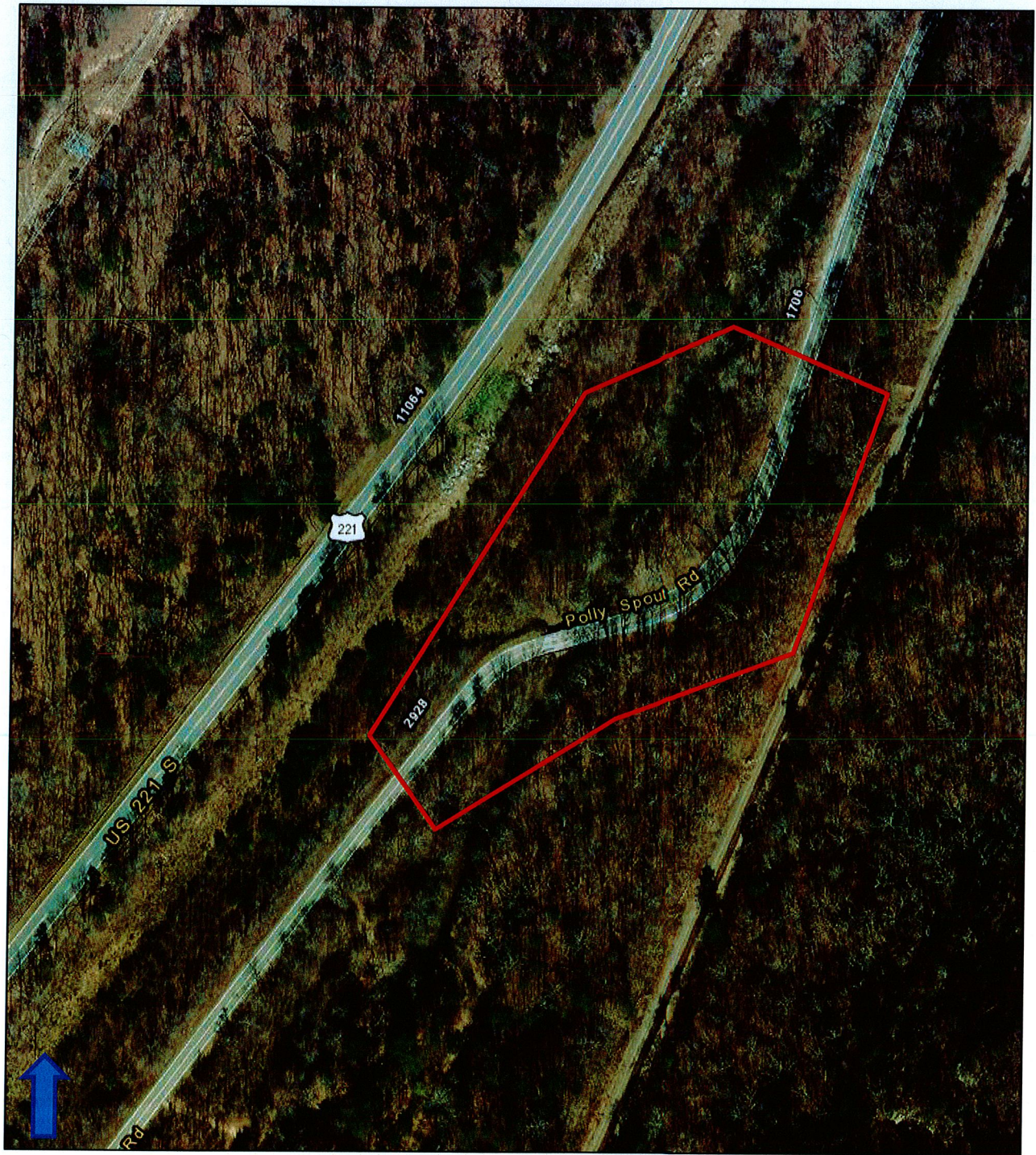
State Historic Preservation Office GIS.