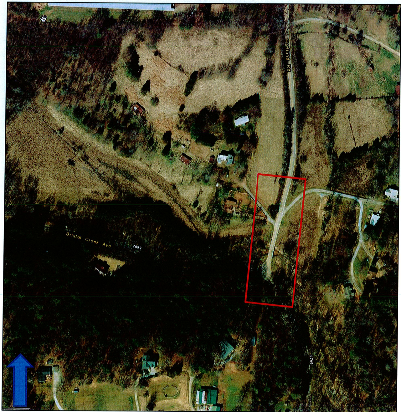
State Historic Preservation Office GIS.