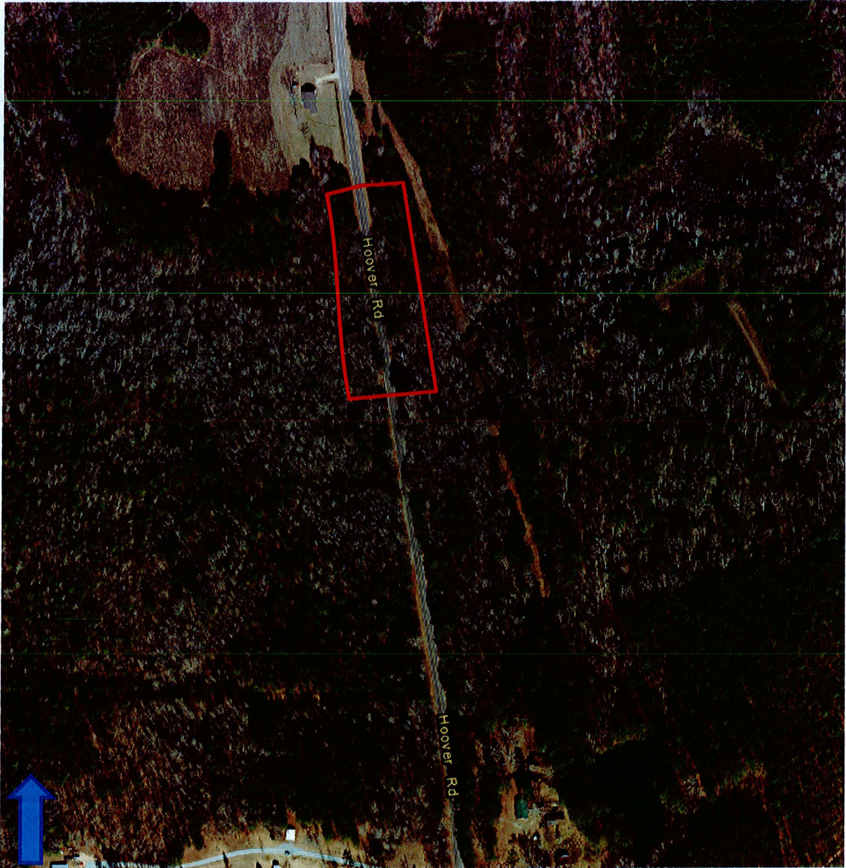
State Historic Preservation Office GIS.