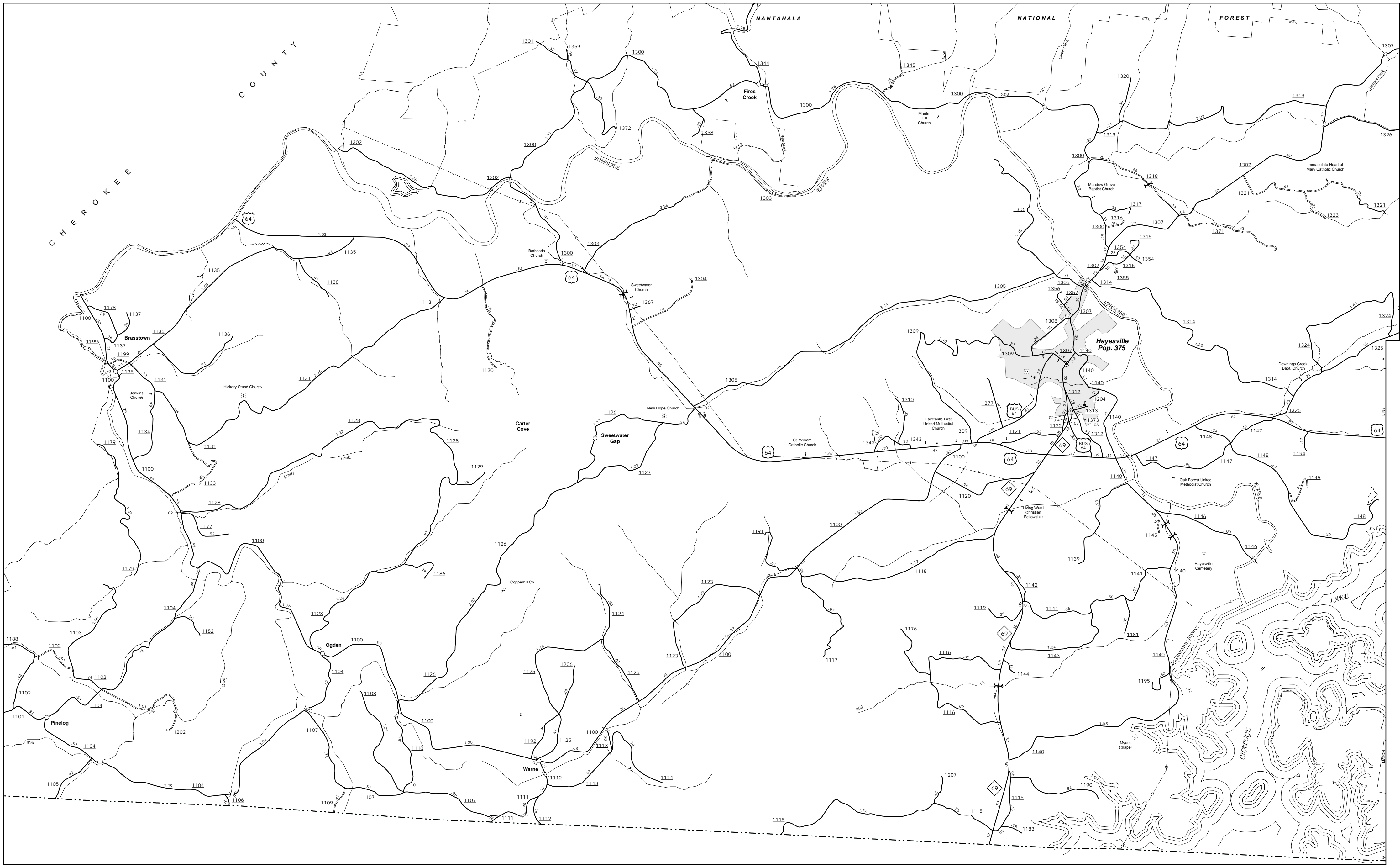
Hayesville And Vicinity

COPIES OF THIS MAP ARE AVAILABLE FOR PURCHASE AT A NOMINAL COST. ADDRESS: N.C. DEPARTMENT OF TRANSPORTATION MSAU - MAPPING SECTION 4809 BERT RD. RALEIGH, NC 27608