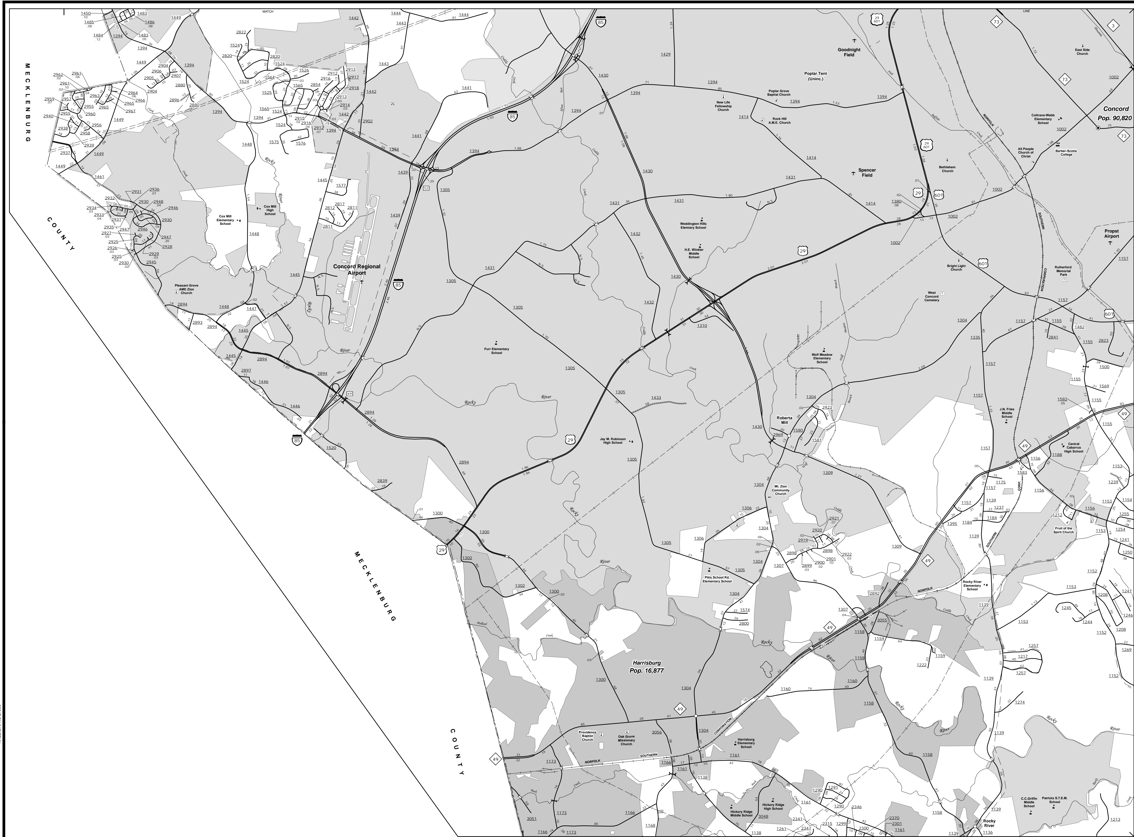
Concord, Harrisburg and Vicinity

COPIES OF THIS MAP ARE AVAILABLE AT A REPRODUCTION COST OF $1.00 PER COPY. N.C. DEPARTMENT OF TRANSPORTATION ADDRESS: 4809 BERT RD. RALEIGH, NC 27608