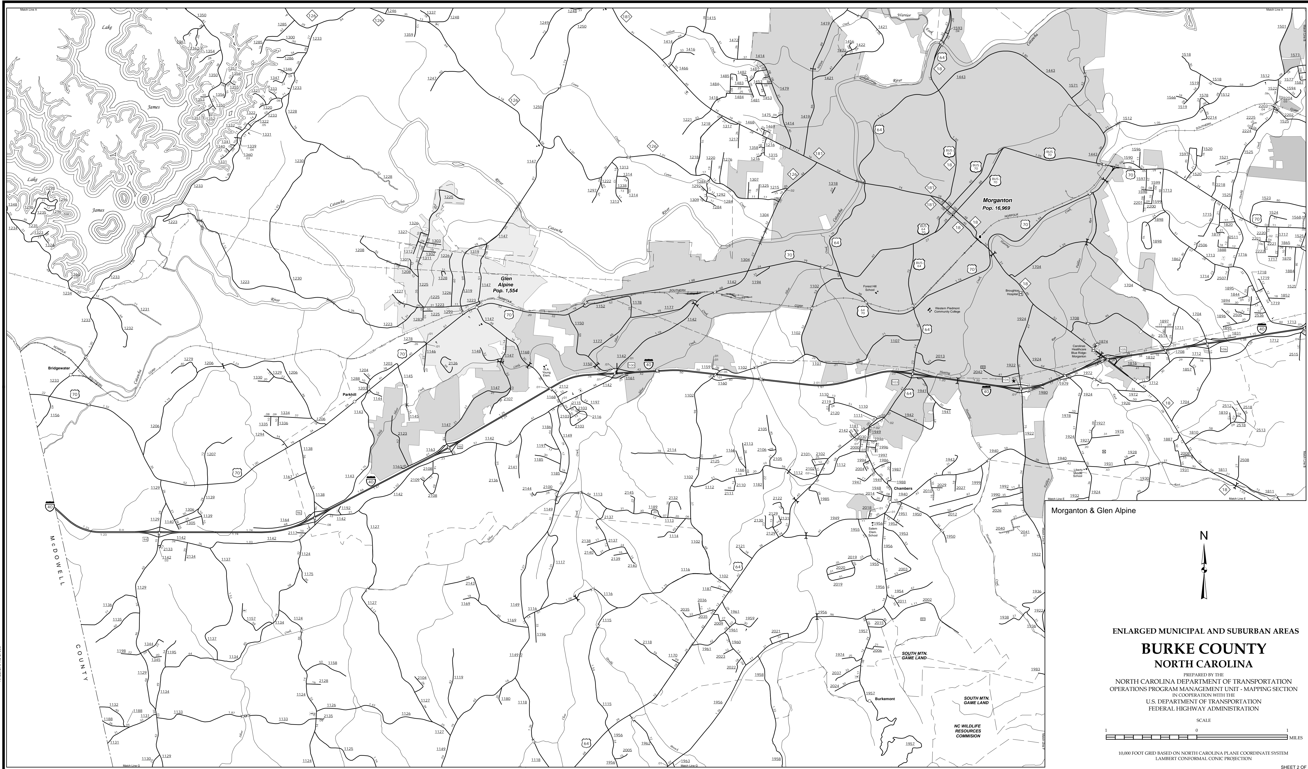
Morganton & Glen Alpine

COPIES OF THIS MAP ARE AVAILABLE FOR PURCHASE AT A PUBLIC NOMINAL COST. ADDRESS: N.C. DEPARTMENT OF TRANSPORTATION MSAU-MAPPING SECTION 4809 BERTI, RD. RALEIGH, NC 27609