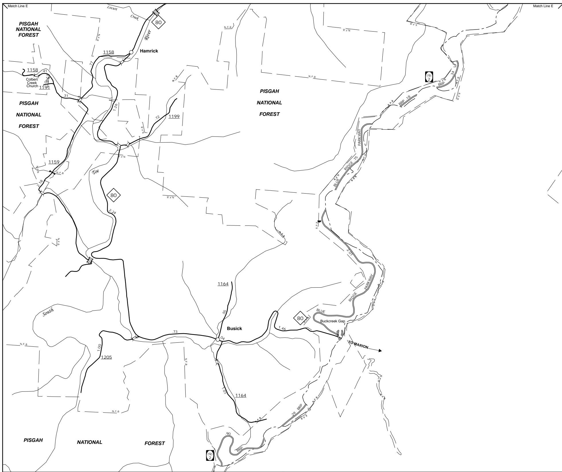
Hamrick & Busick