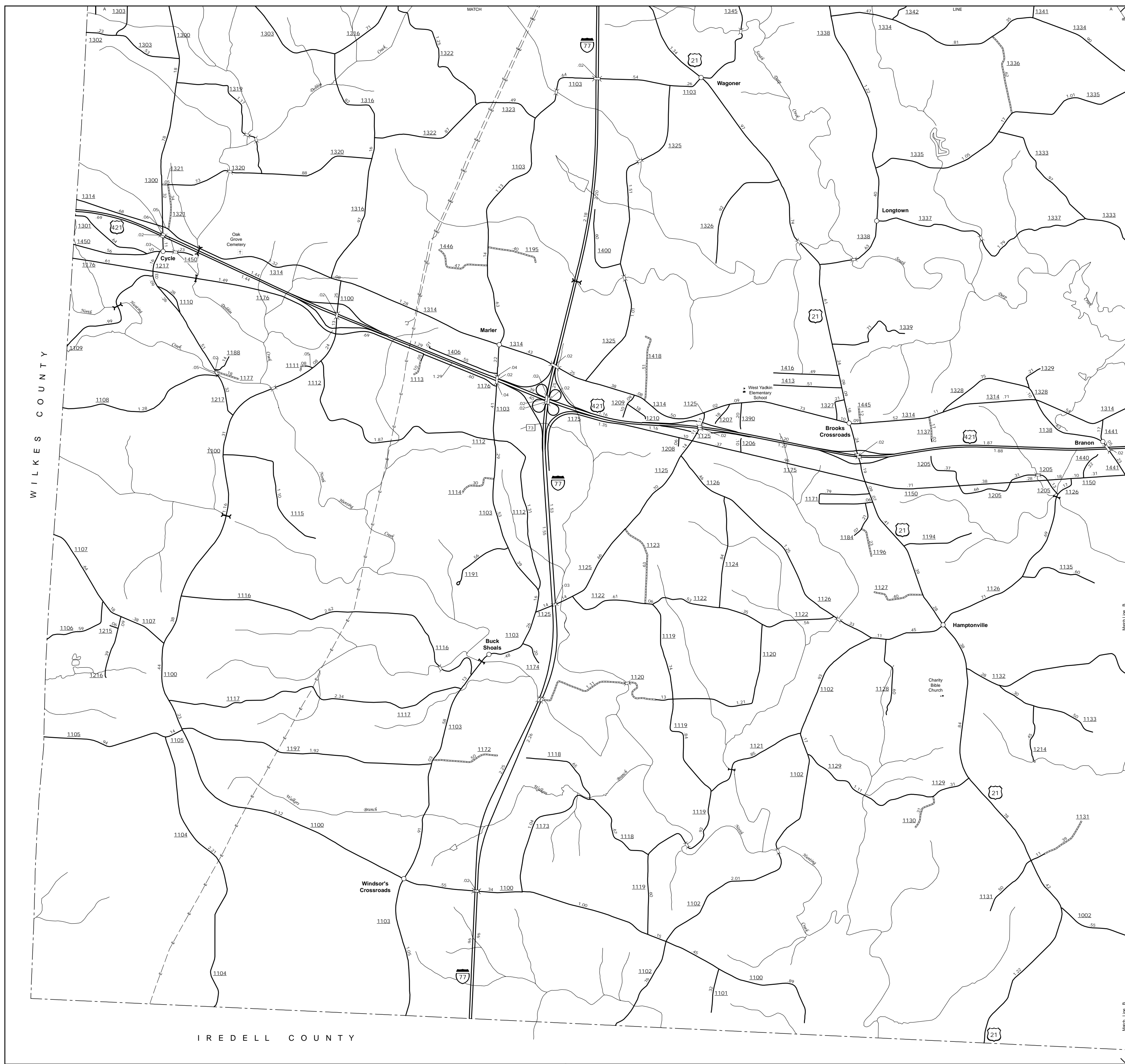
Marler, Cycle and Vicinity

COPIES OF THIS MAP ARE AVAILABLE FOR PURCHASE AT A PUBLIC AT NOMINAL COST. ADDRESS: N.C. DEPARTMENT OF TRANSPORTATION MSAU - MAPPING SECTION 4809 BERT LEO Raleigh, NC 27609