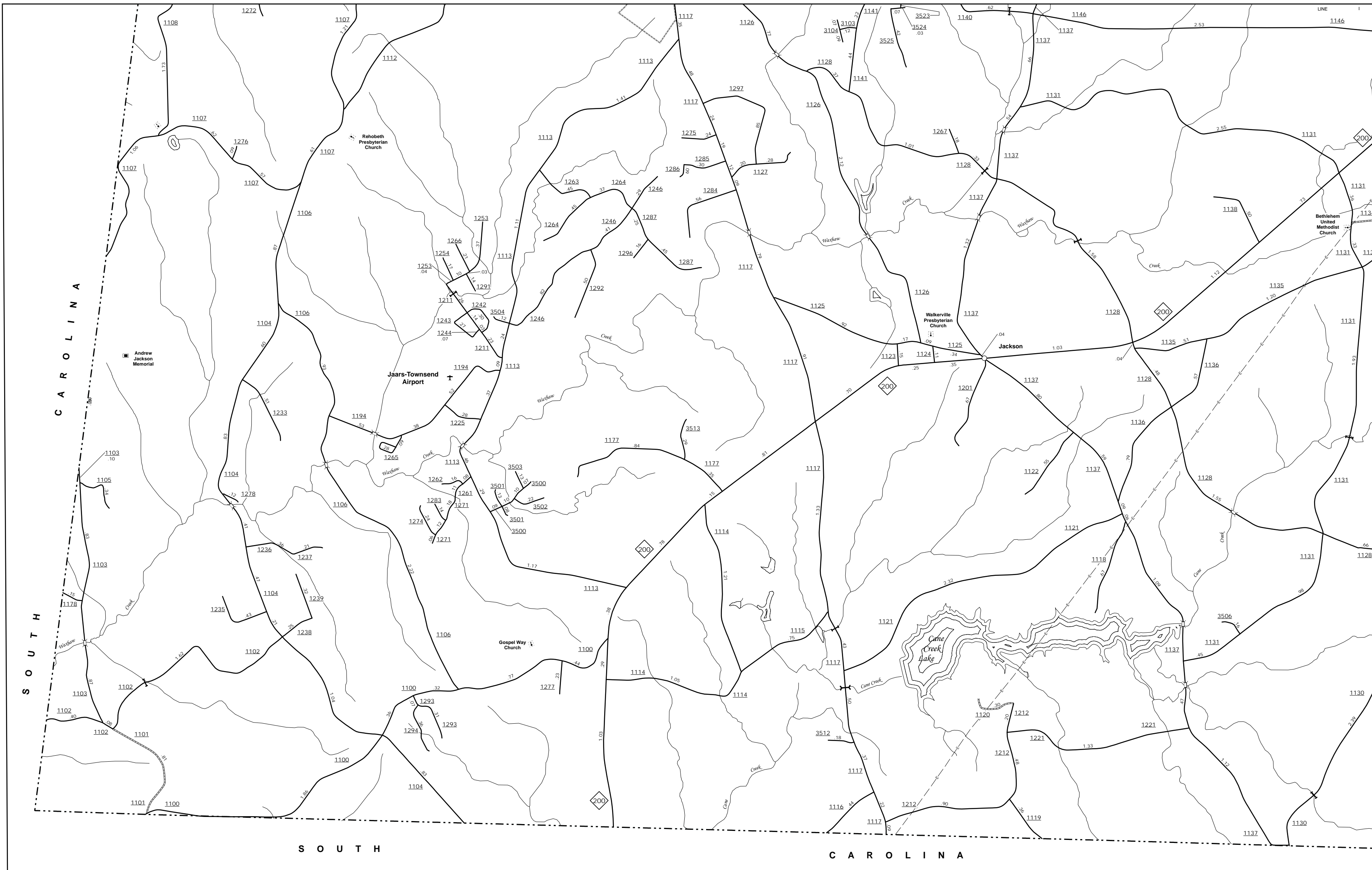
Jackson and Vicinity