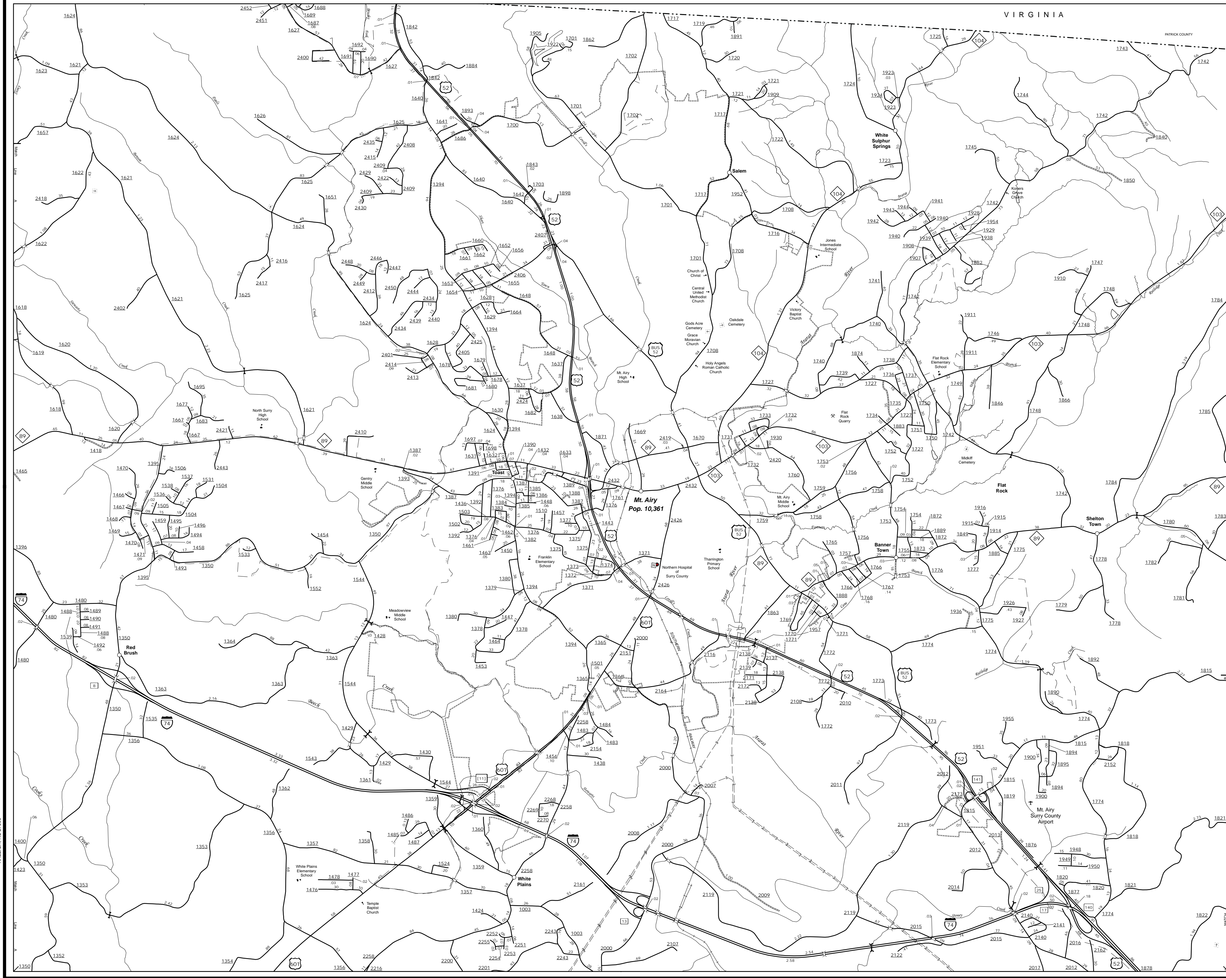
MT. Airy and Vicinity

COPIES OF THIS MAP ARE AVAILABLE FROM THE N.C. DEPARTMENT OF TRANSPORTATION ADDRESS: N.C. DEPARTMENT OF TRANSPORTATION MS&U - MAPPING SECTION 4809 BERTL RD. Raleigh, NC 27609