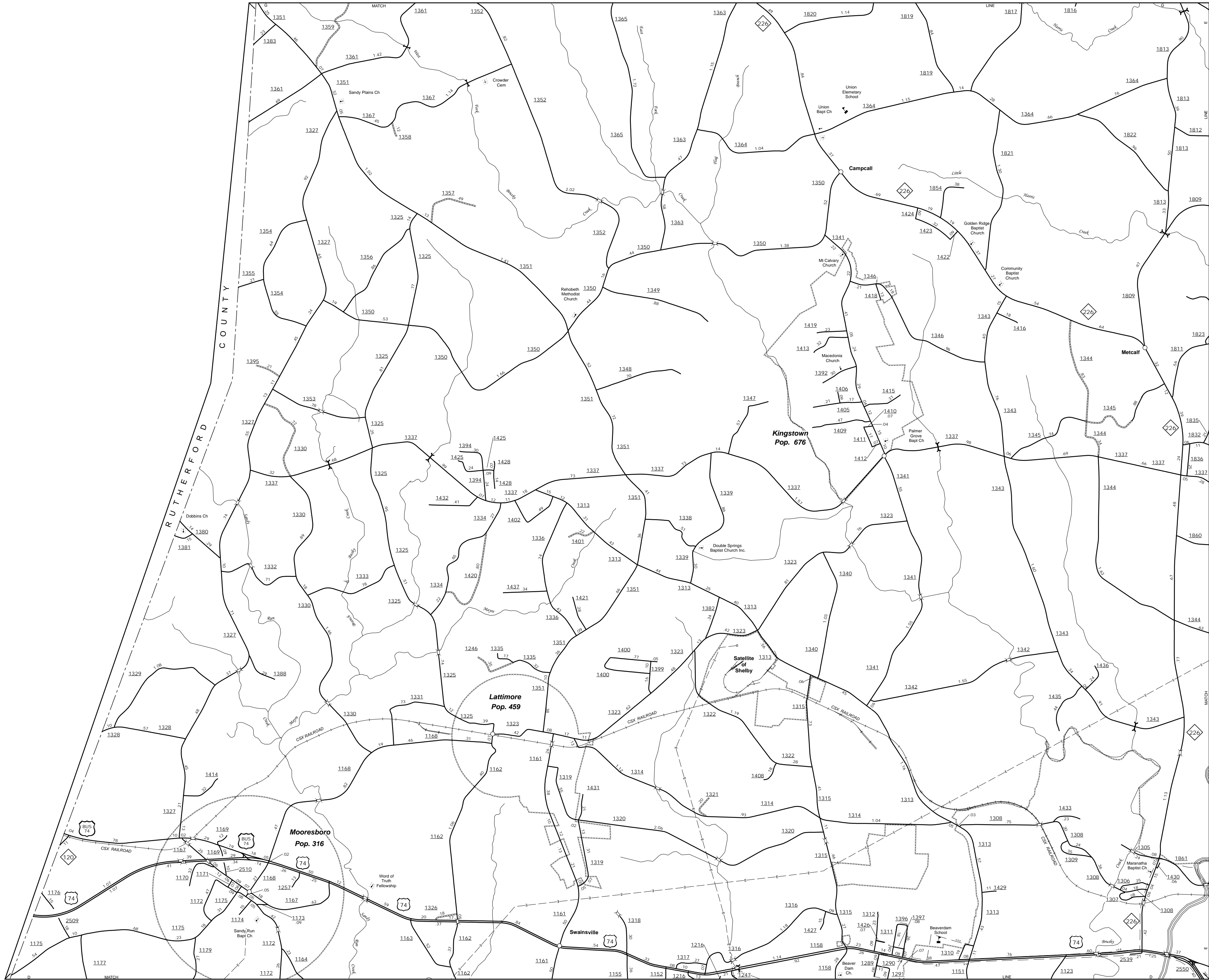
Mooresboro, Lattimore & Kingstown

COPIES OF THIS MAP ARE AVAILABLE FOR PURCHASE AT A PUBLIC AT NOMINAL COST. ADDRESS: N.C. DEPARTMENT OF TRANSPORTATION MSAU - MAPPING SECTION 4809 BERT RD. RALEIGH, NC 27608