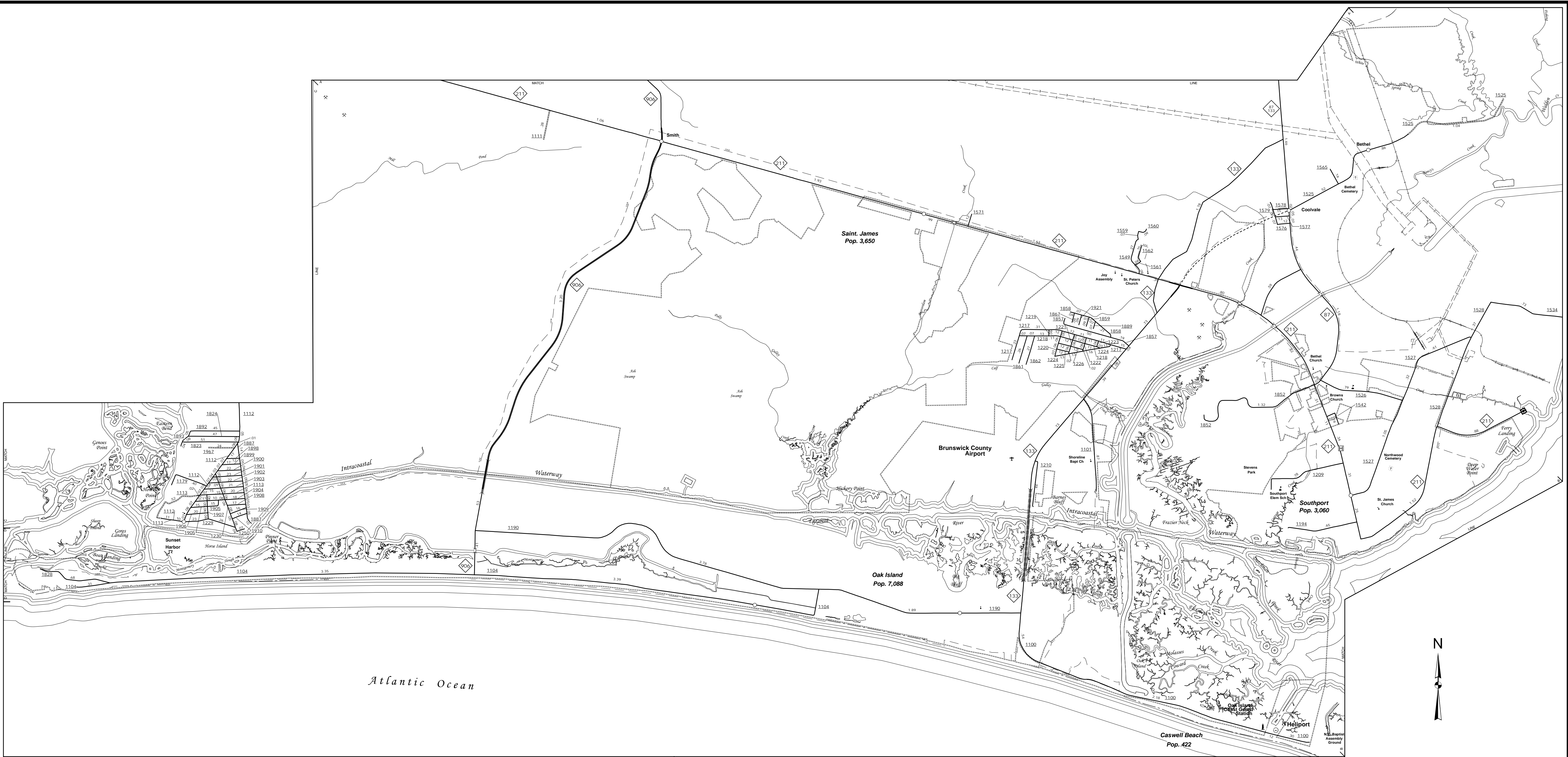
Southport and Vicinity

The Mapping Section's goal is to provide the most accurate and current information possible. Map data is compiled from numerous sources with varying degrees of accuracy. Map accuracy standards are a result of the accuracy of the data sources used. The map data is not intended to be used for legal purposes. For additional information, visit http://www.ncdot.gov/itservices/mapping , and click on Data Providers or contact us by phone at (919) 835-8480.