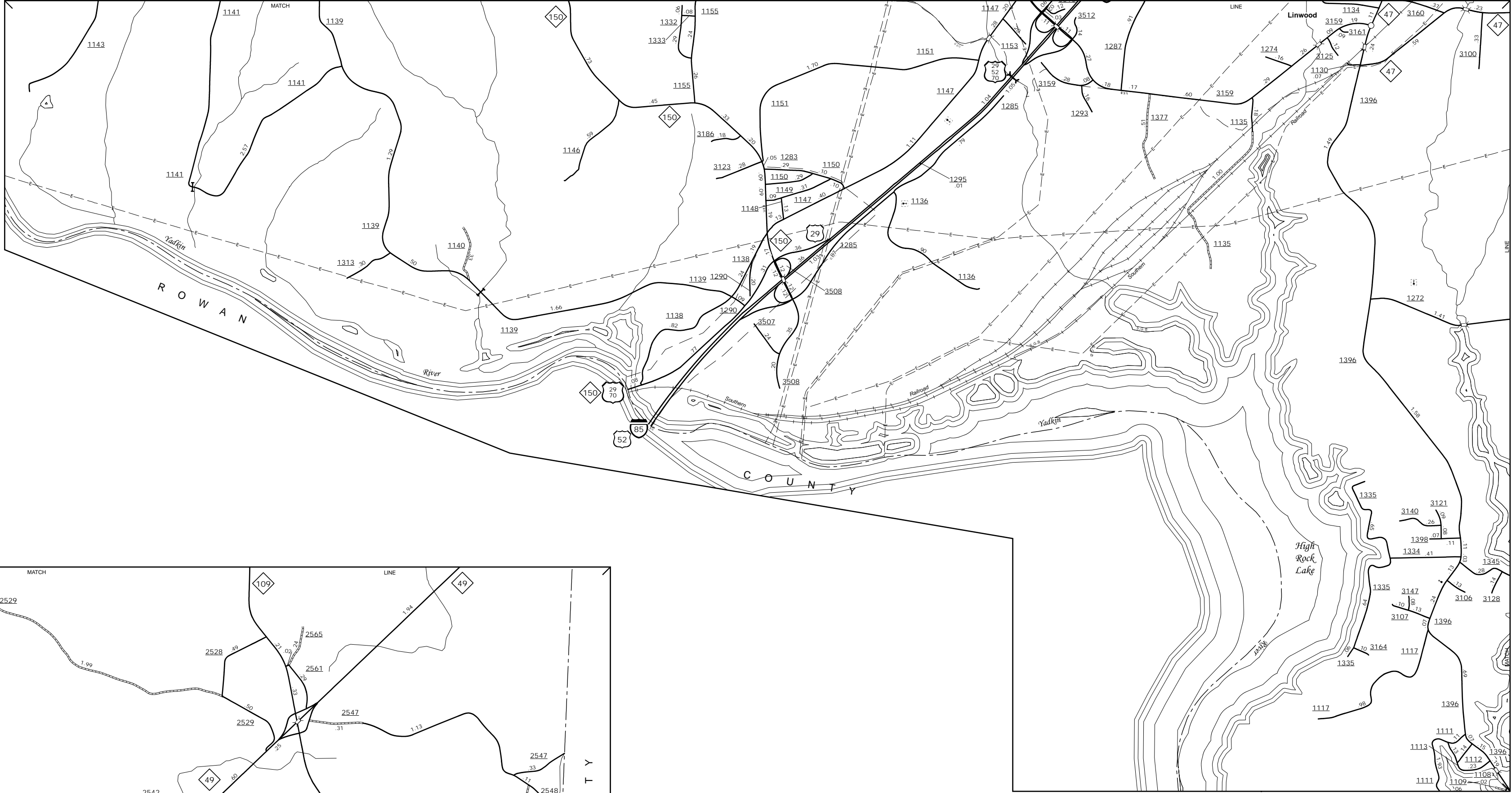
Linwood and Vicinity