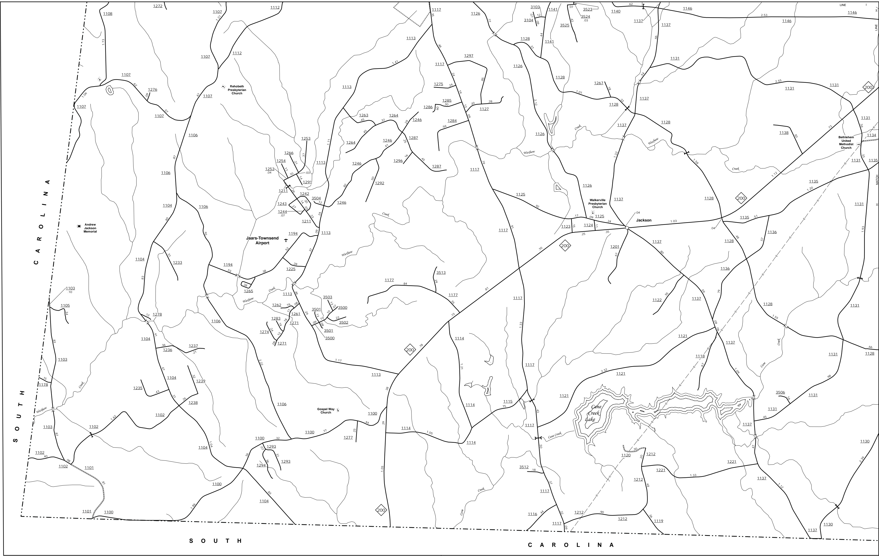
Jackson and Vicinity

COPIES OF THIS MAP ARE AVAILABLE FOR PURCHASE AT A SPECIAL DISCOUNT PRICE. N.C. DEPARTMENT OF TRANSPORTATION MS&U - MAPPING SECTION 4809 BERN LANE Raleigh, NC 27606