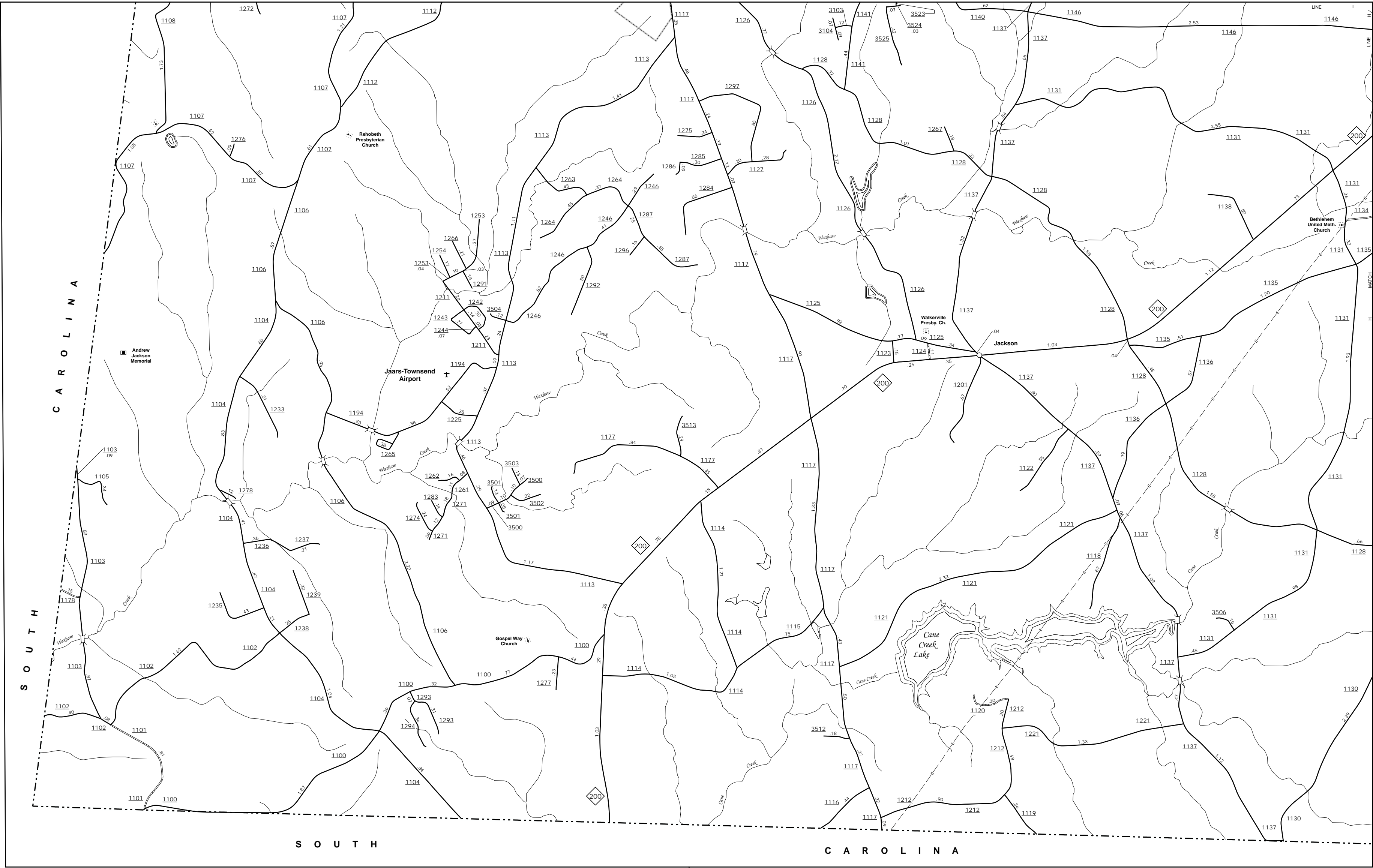
Jackson and Vicinity