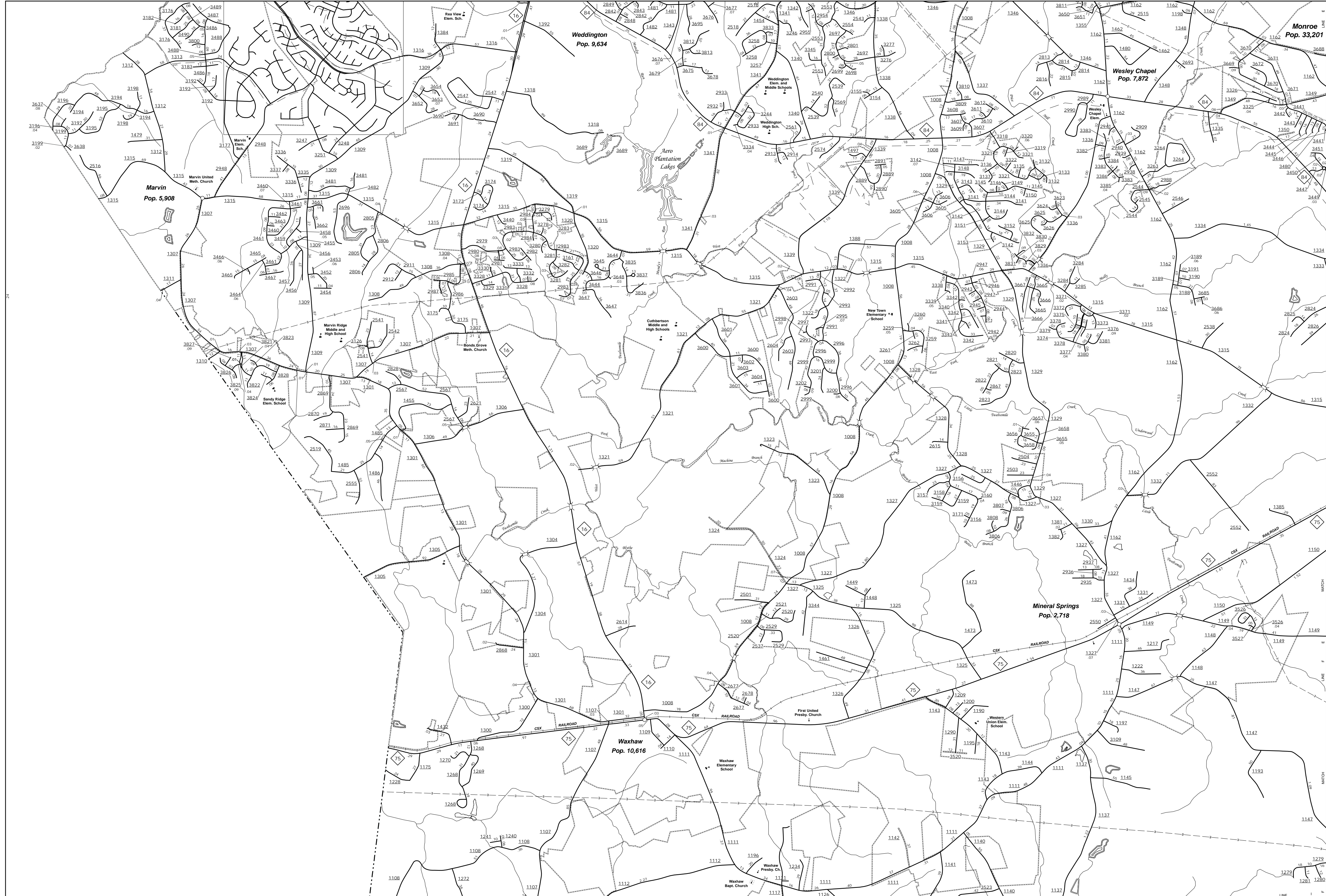
Marvin, Mineral Spring, Wesley Chapel and Waxhaw

COPIES OF THIS MAP ARE AVAILABLE TO THE PUBLIC AT NOMINAL COST. ADDRESS: MAPS SECTION N.C. DEPARTMENT OF TRANSPORTATION 4809 BERTL RD. RALEIGH, NC 27608