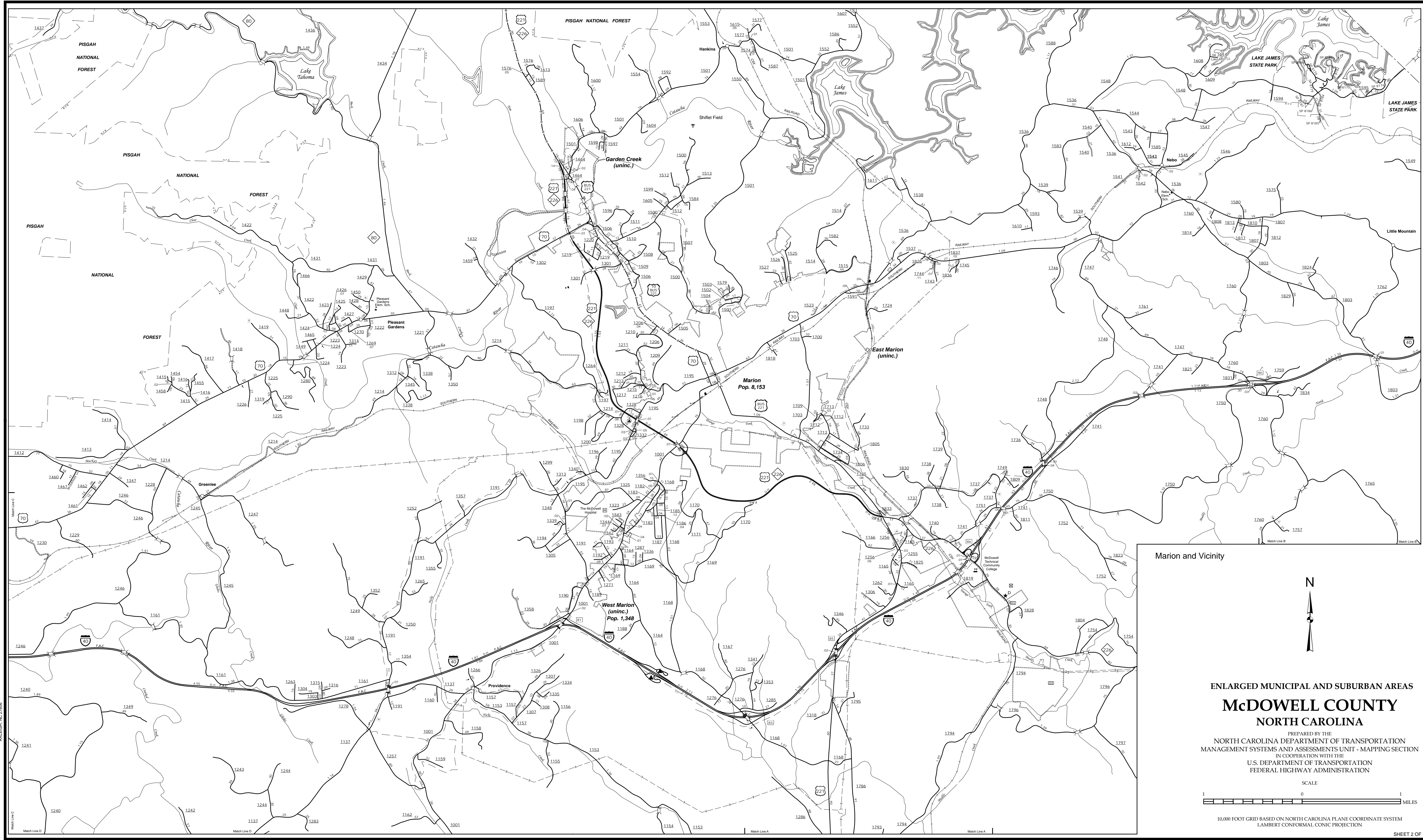
Marion and Vicinity

COPIES OF THIS MAP ARE AVAILABLE TO THE PUBLIC AT NOMINAL COST. N.C. DEPARTMENT OF TRANSPORTATION MSAU-MAPPING SECTION 4809 BERYL RD. RALEIGH, NC 27608