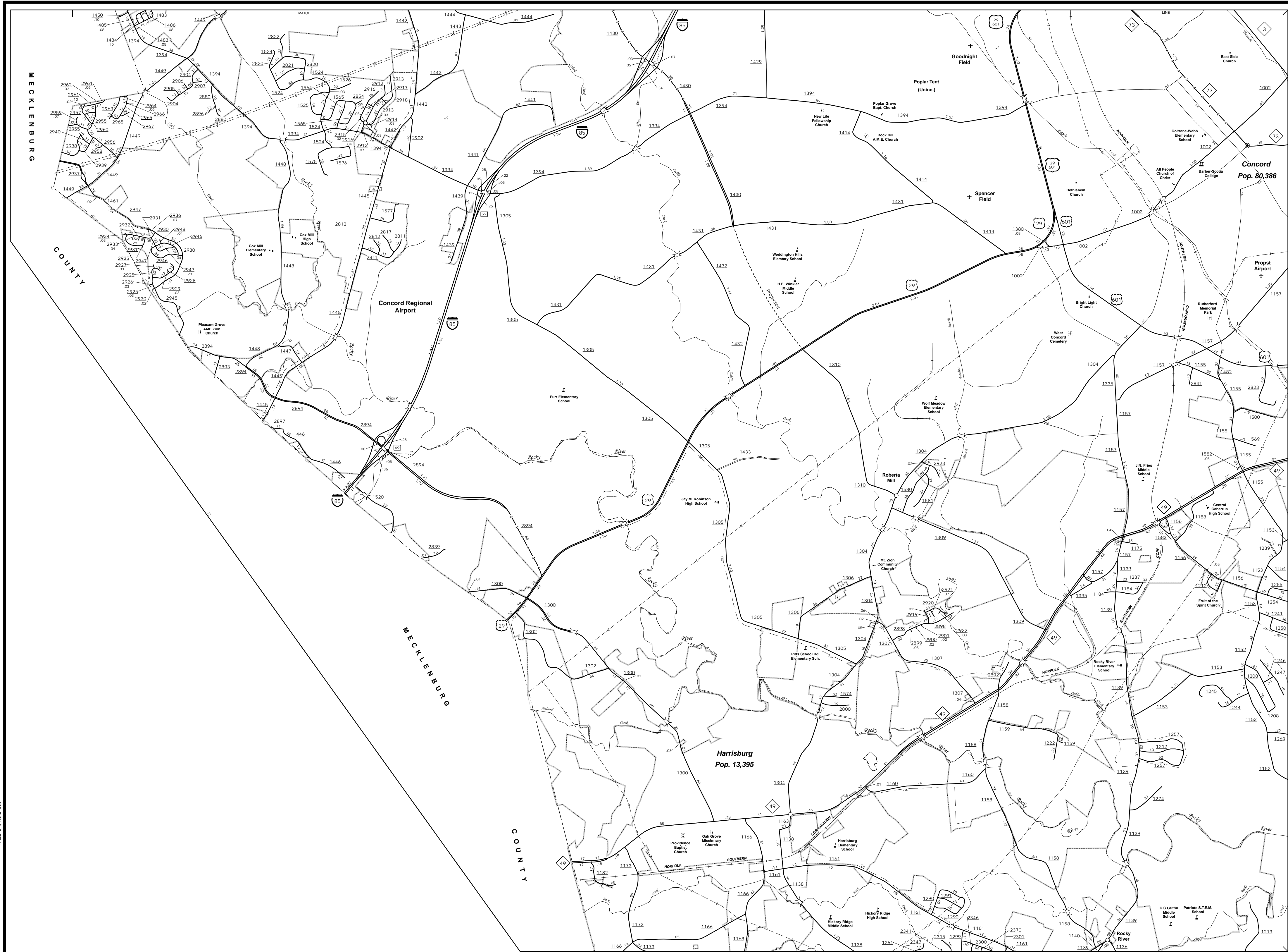
Concord, Harrisburg and Vicinity

COPIES OF THIS MAP ARE AVAILABLE TO THE PUBLIC AT NOMINAL COST. ADDRESS: ADDRESS N.C. DEPARTMENT OF TRANSPORTATION MSAU - MAPPING SECTION 4809 BERTL RD. RALEIGH, NC 27605