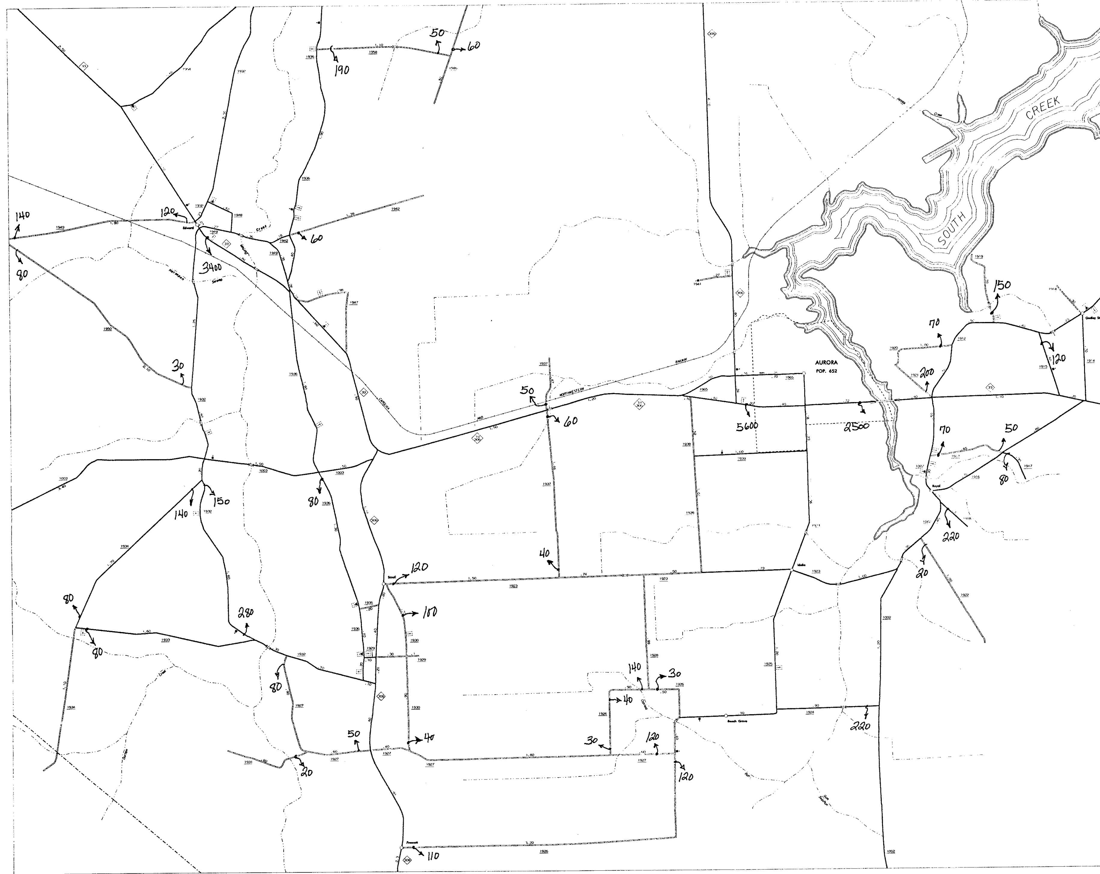
AURORA AND VICINITY