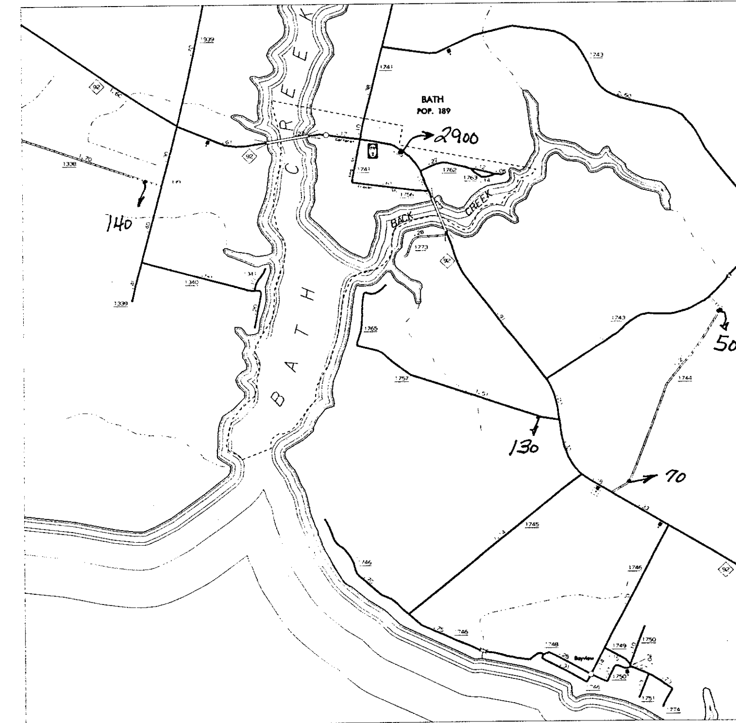
BATH AND VICINITY