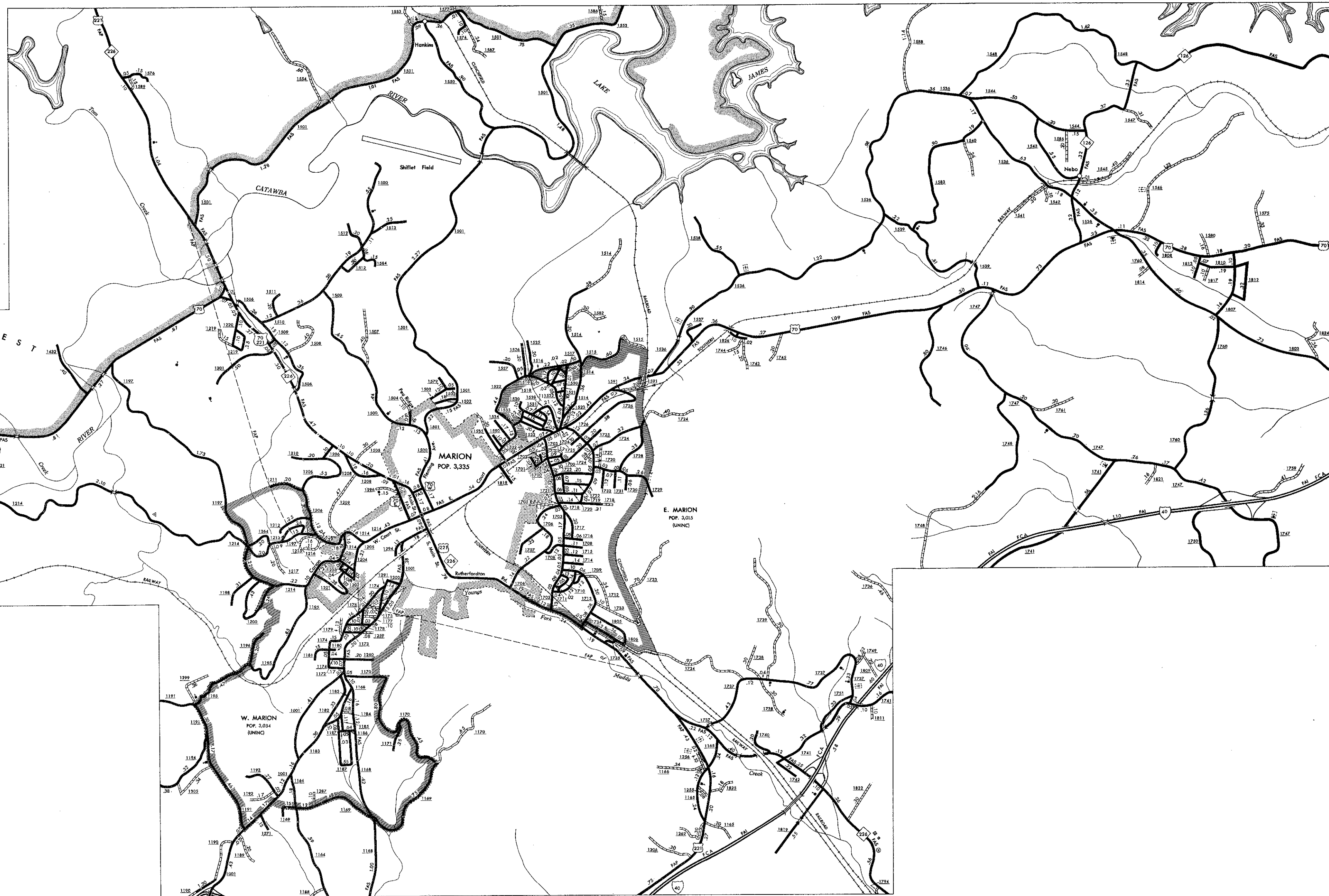
MARION AND VICINITY