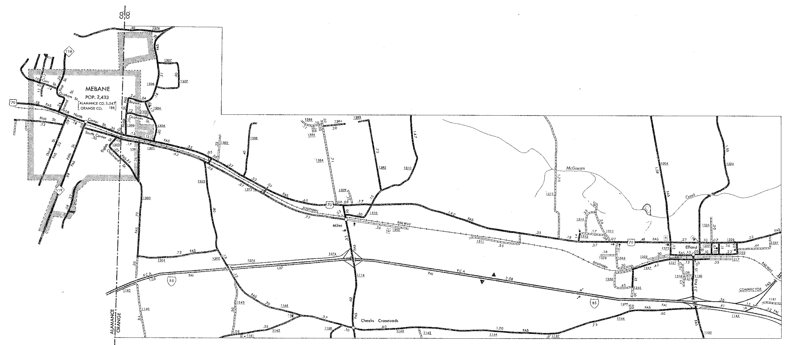
MEBANE - EFLAND AND VICINITY