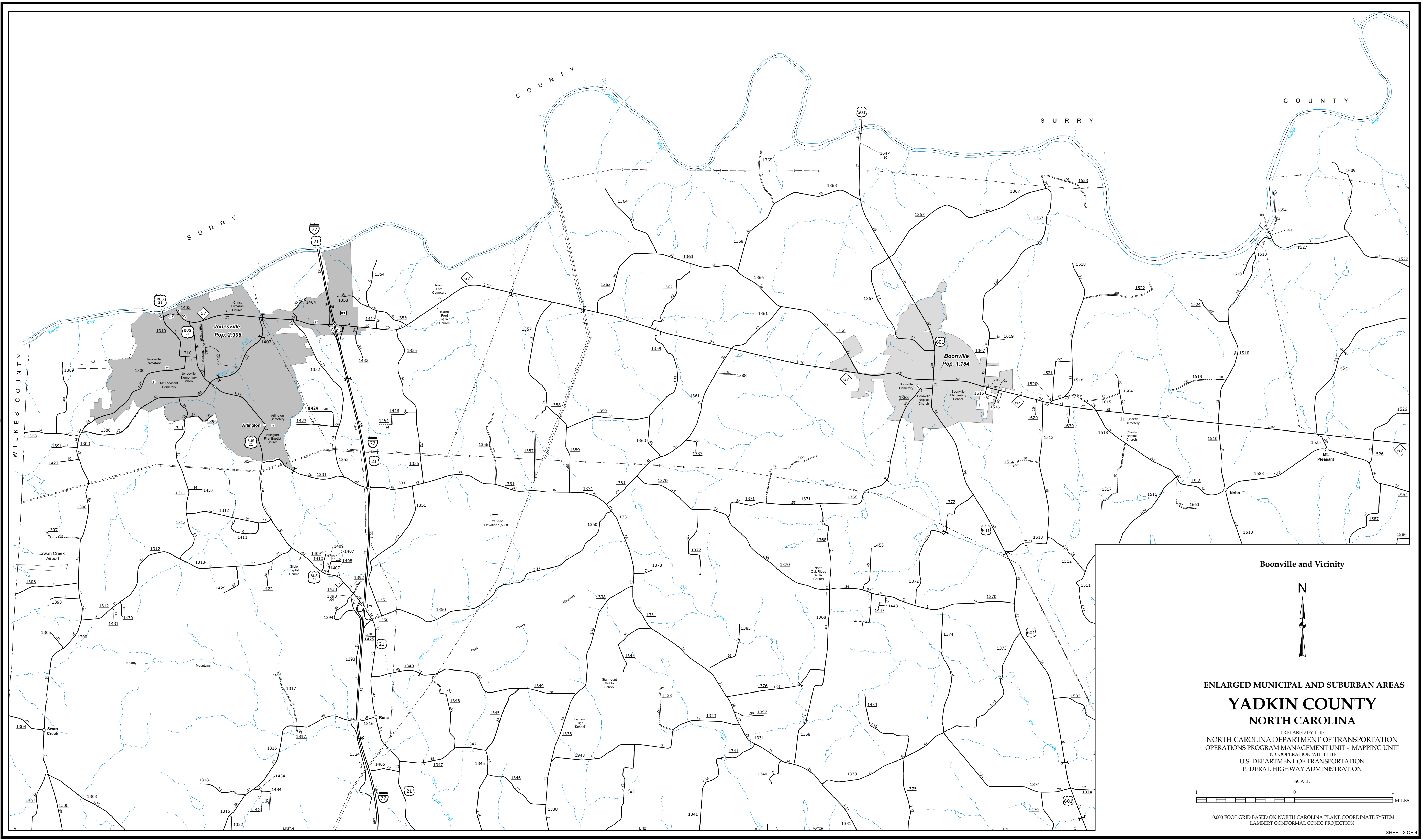
Boonville and Vicinity

COPIES OF THIS MAP ARE AVAILABLE FOR PURCHASE AT A NOMINAL COST. ADDRESS: N.C. DEPARTMENT OF TRANSPORTATION, MS-40, MAPS SECTION, 8601 BERRY LANE, RALEIGH, NC 27606