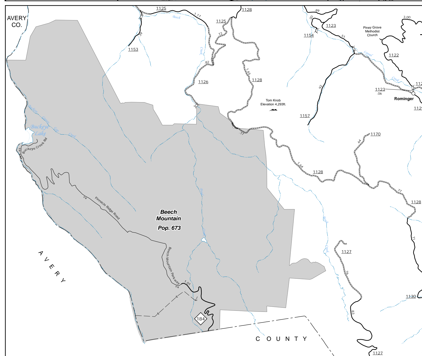
Beech Mountain and Vicinity