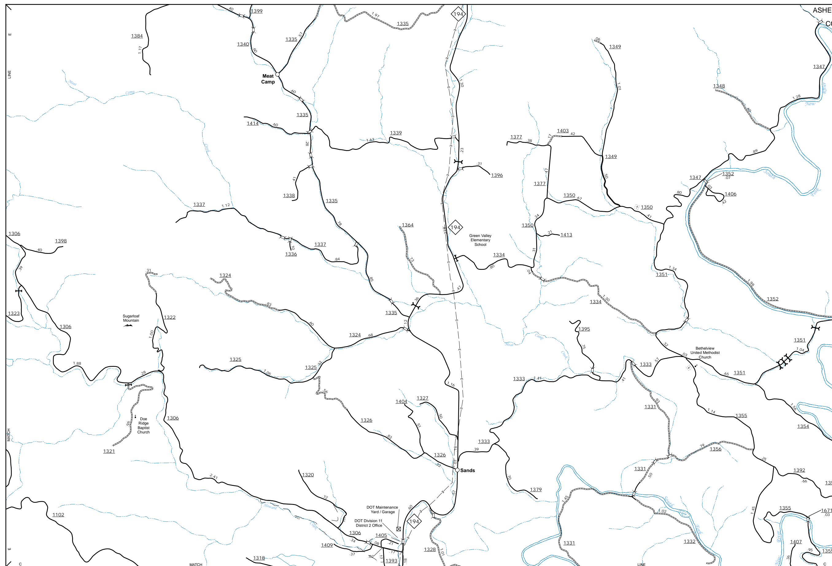
Sands and Vicinity