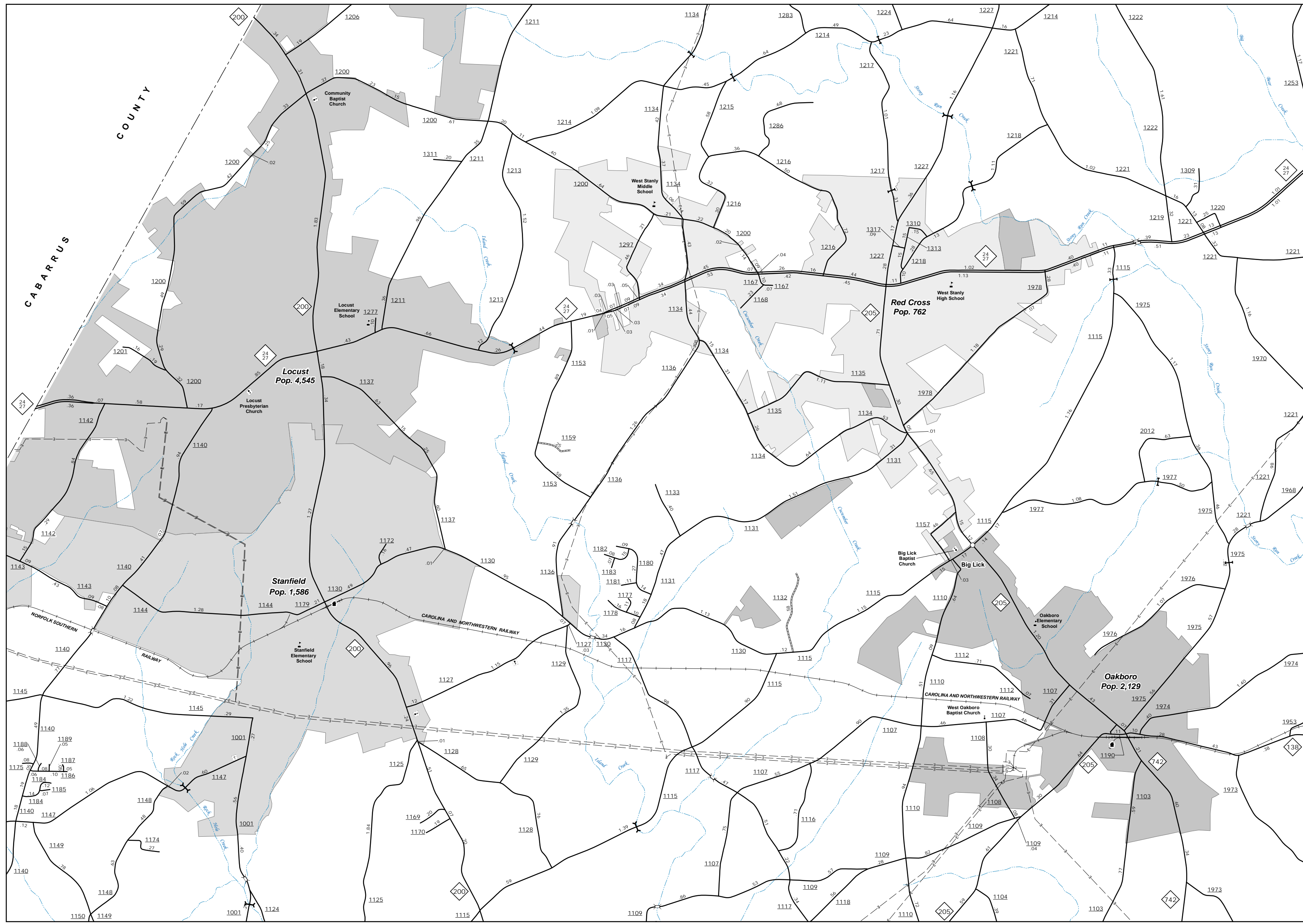
Oakboro, Red Cross and Vicinity