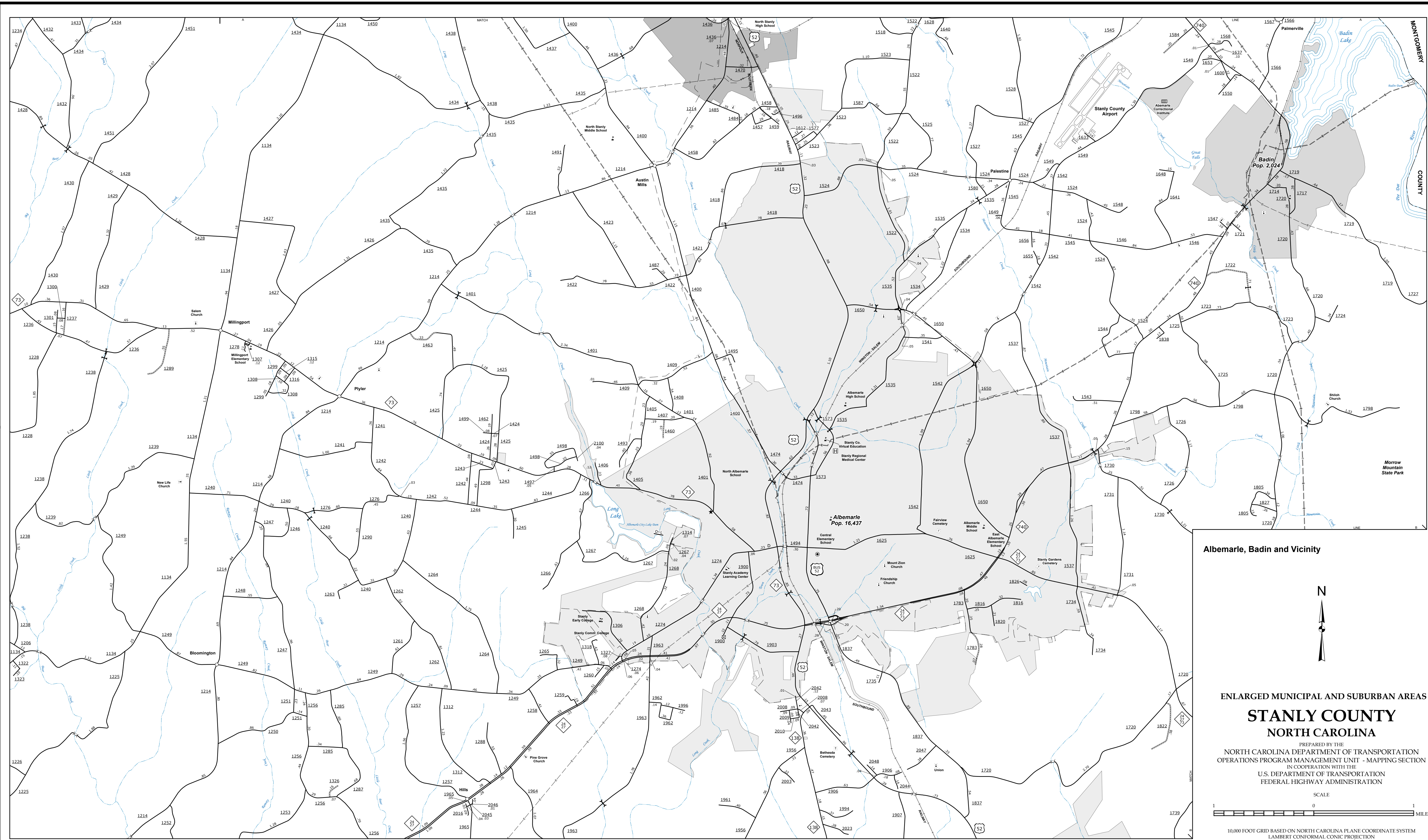
Albemarle, Badin and Vicinity

COPIES OF THIS MAP ARE AVAILABLE AT A PUBLIC NOMINAL COST. ADDRESS INFORMATION IS PROVIDED FOR THE MAJOR ROADS AND HIGHWAYS. FOR ADDITIONAL INFORMATION, VISIT www.ncdot.gov OR CALL 1-800-368-6848.