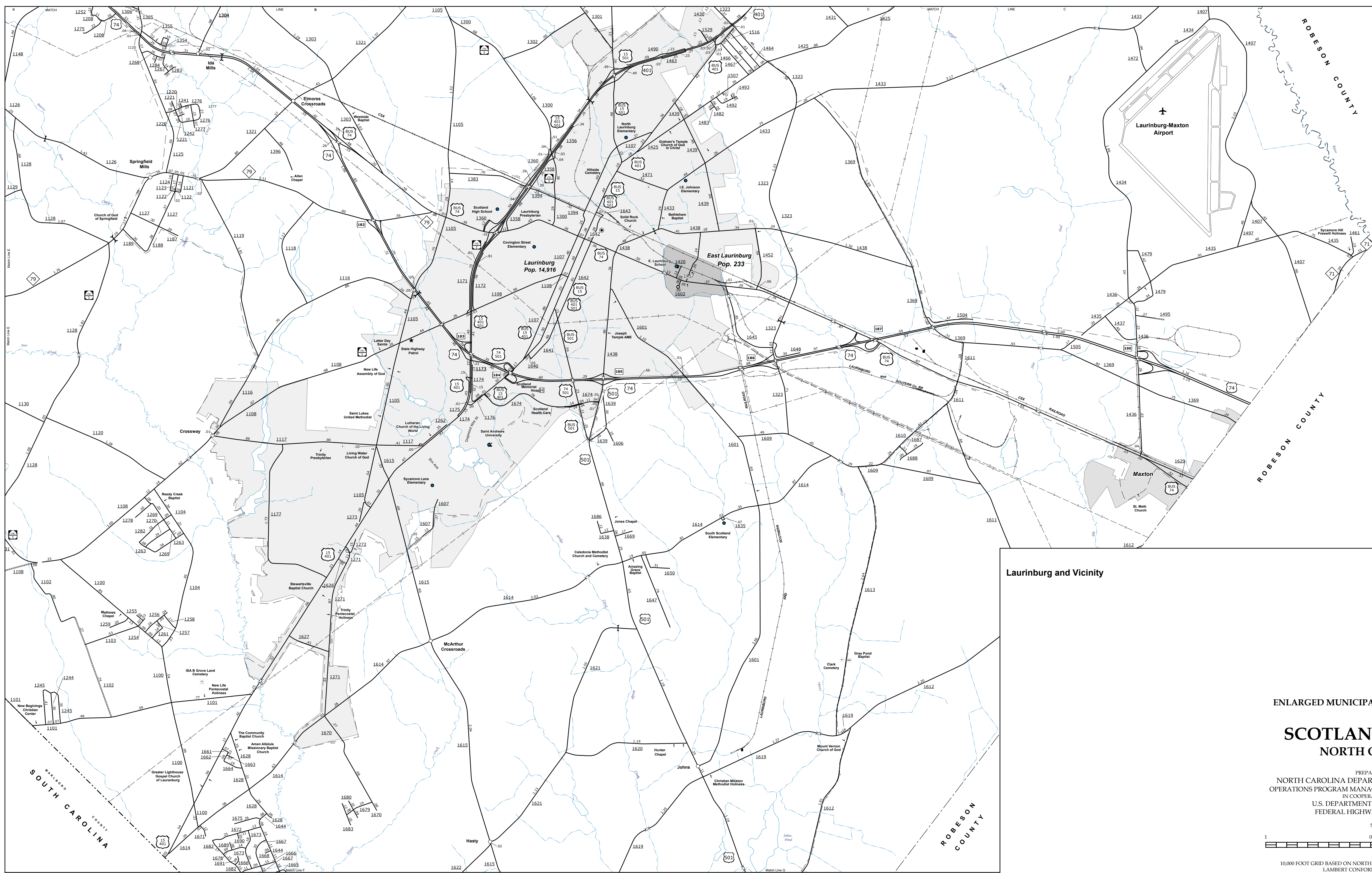
Laurinburg and Vicinity

COPIES OF THIS MAP ARE AVAILABLE FOR PURCHASE AT A PUBLIC NOMINAL COST. ADDRESS: NORTH CAROLINA DEPARTMENT OF TRANSPORTATION, 6001 BERRY LANE, RALEIGH, NC 27609