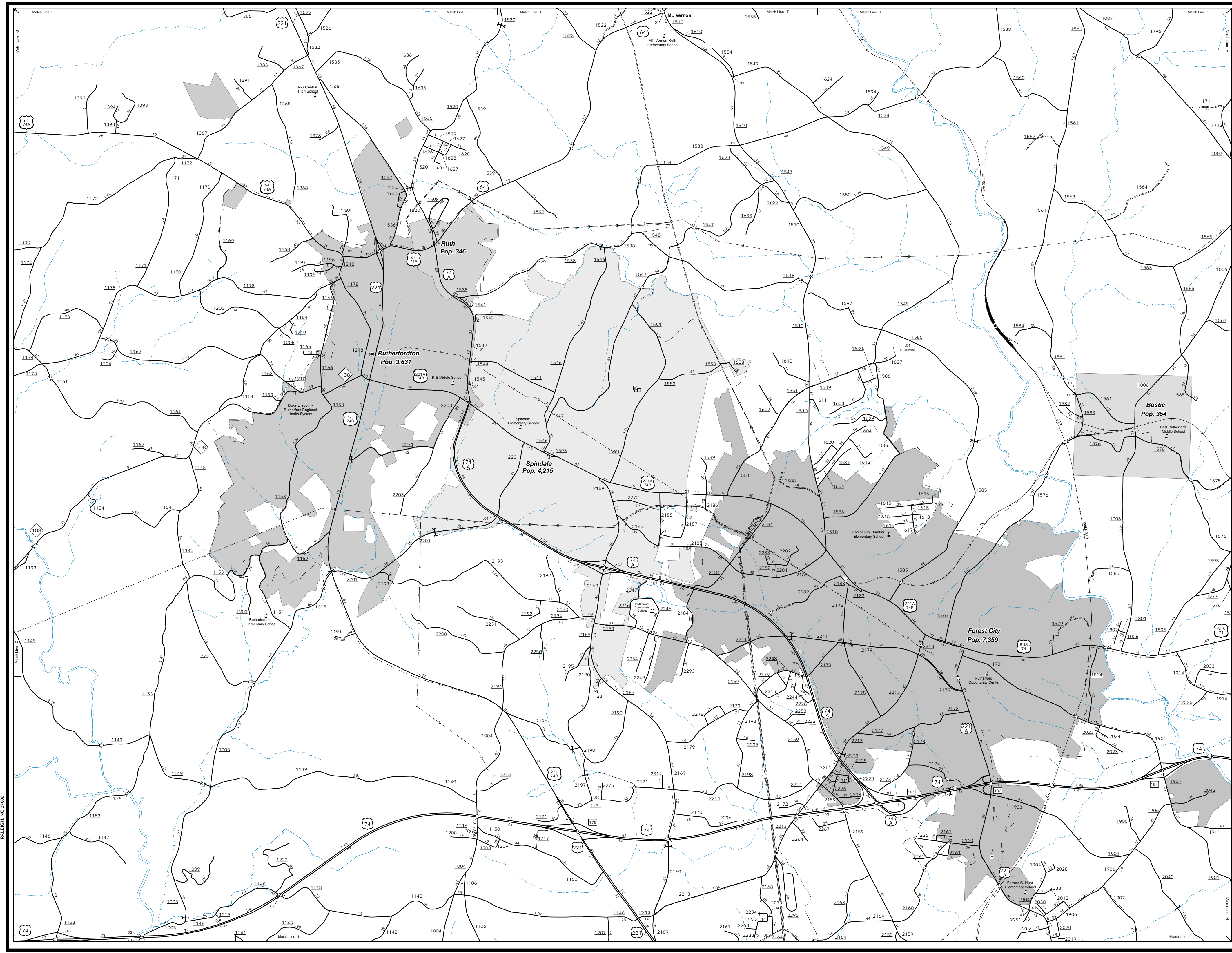
Forest City, Spindale, Rutherfordton and Vicinity

COPIES OF THIS MAP ARE AVAILABLE FOR PURCHASE AT A PUBLIC NOMINAL COST. ADDRESS: N.C. DEPARTMENT OF TRANSPORTATION MAU MAPPING SECTION 4805 BERNI, LD. RALEIGH, NC 27609