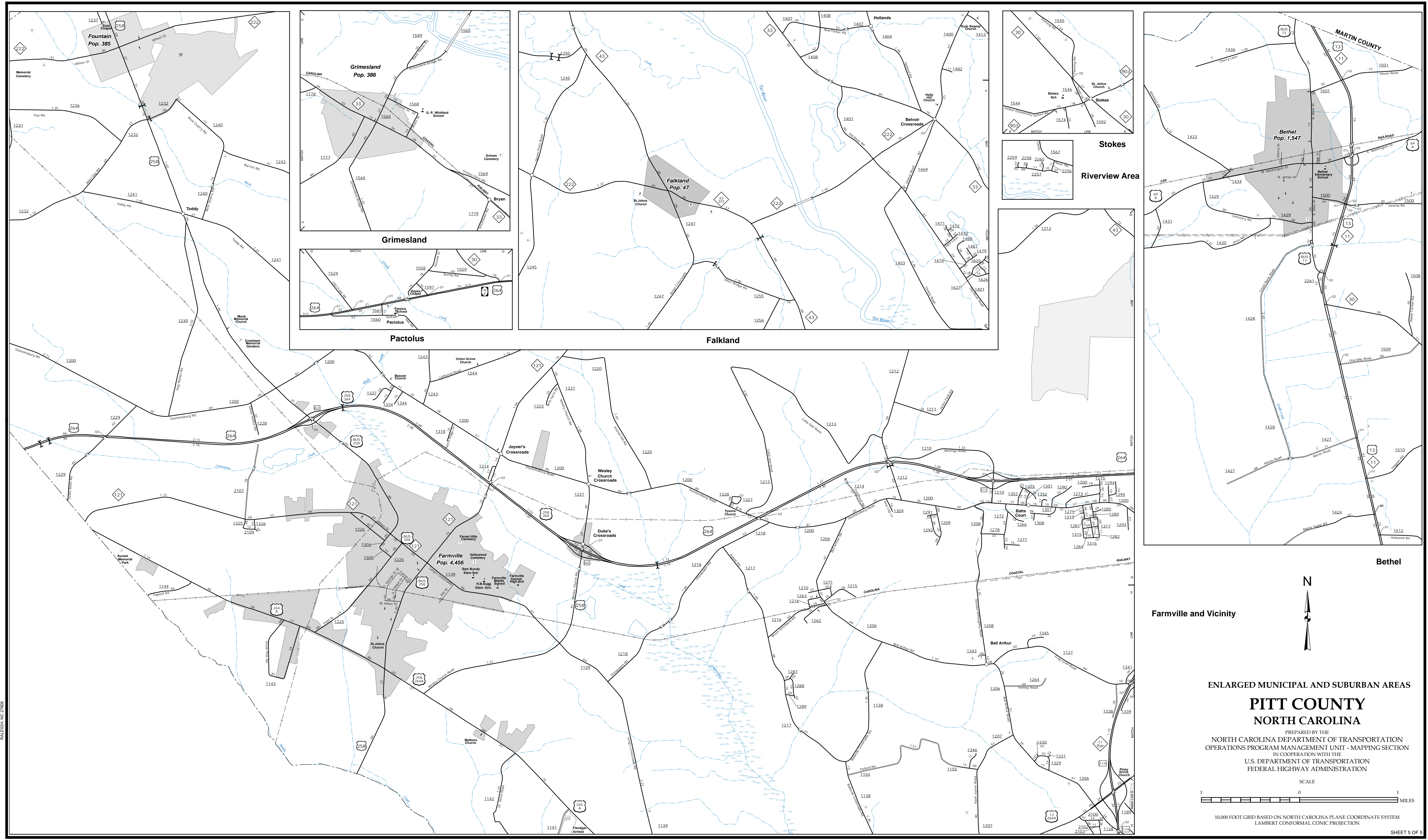
Farmville and Vicinity

COPIES OF THIS MAP ARE AVAILABLE FROM THE N.C. DEPARTMENT OF TRANSPORTATION ADDRESS: MSAU-MAPPING SECTION 4801 BERNI, LD. RALEIGH, NC 27606