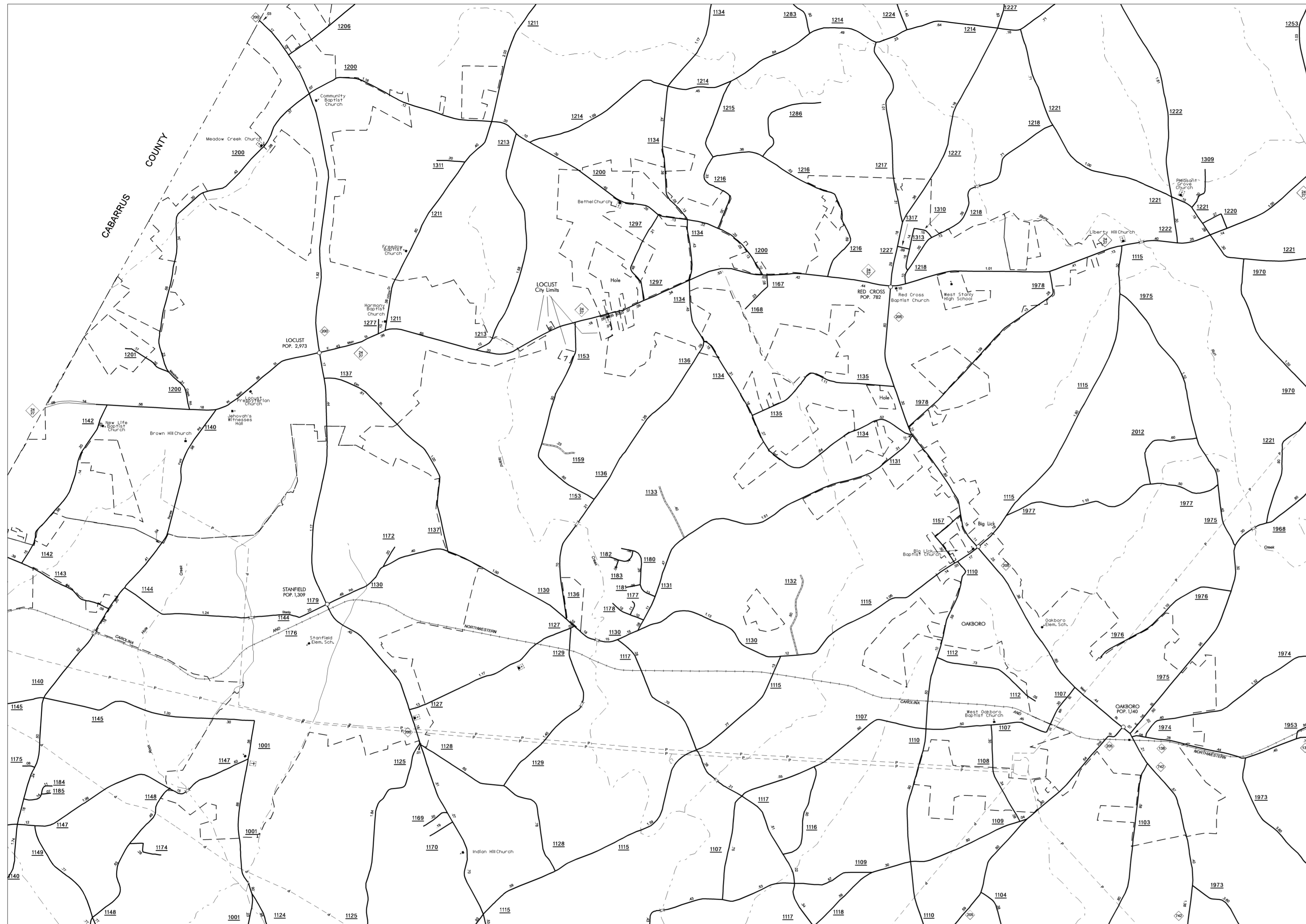
Stanfield, Locust, and Oakboro