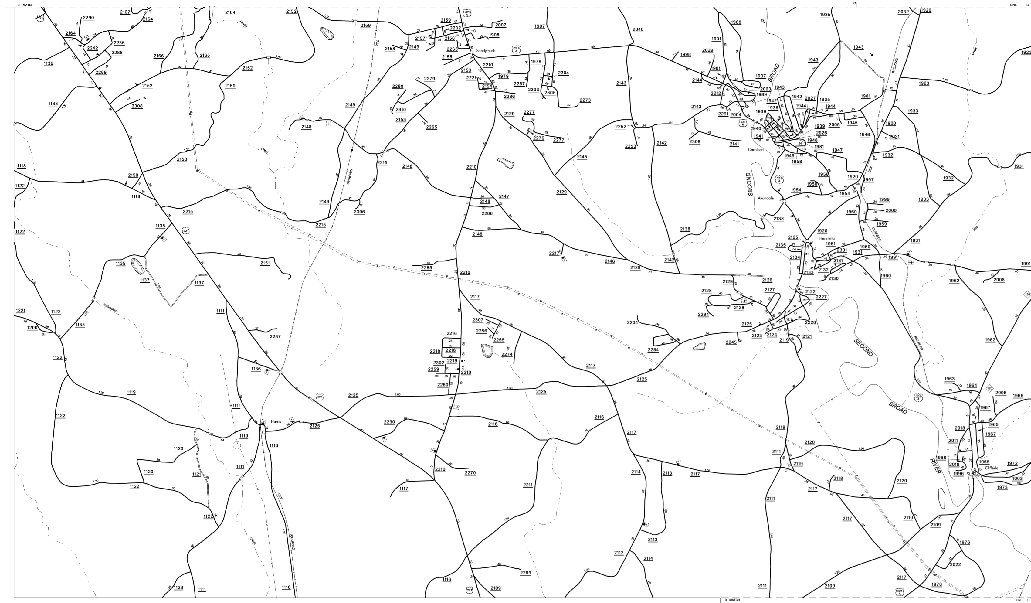
Henrietta and Vicinity