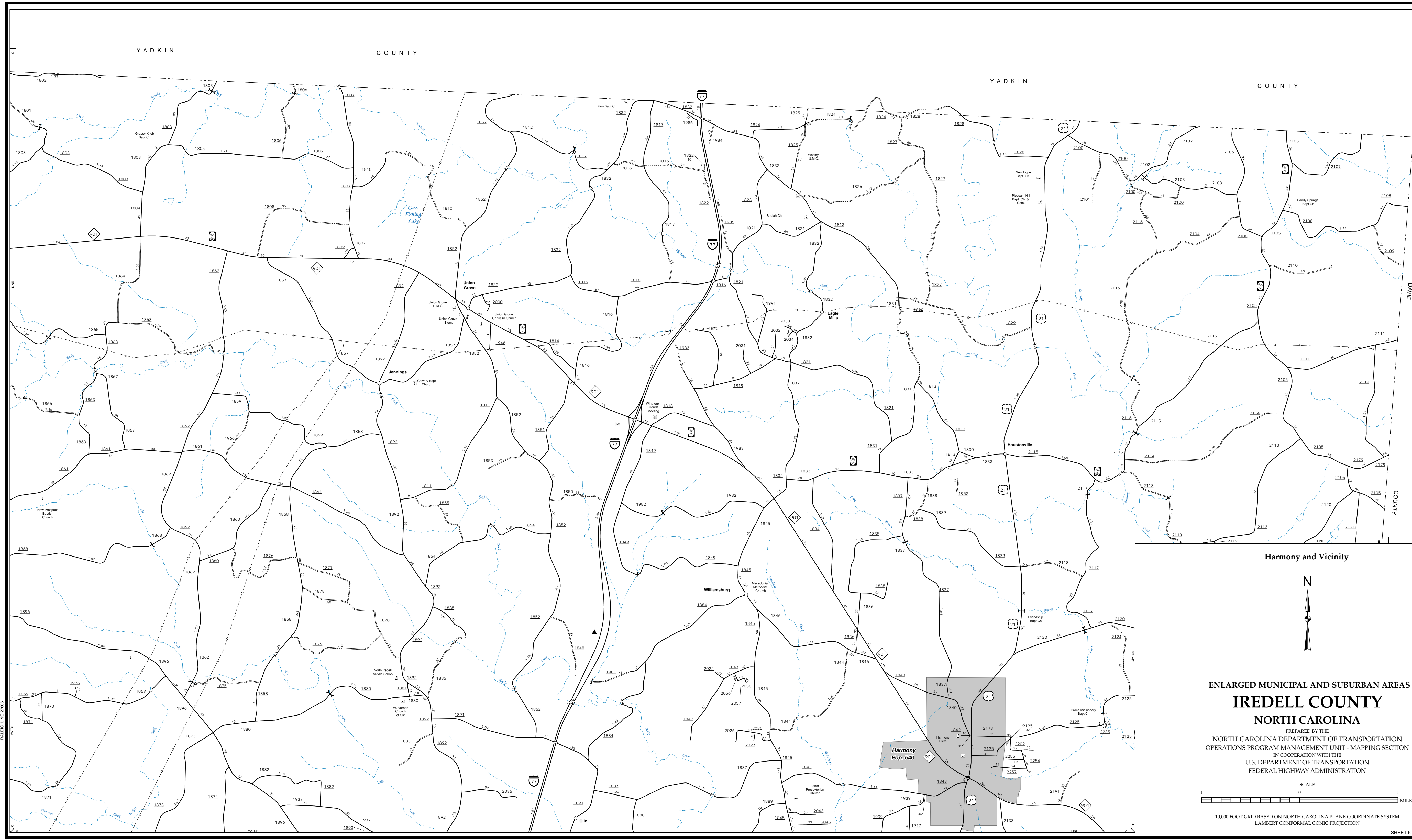
Harmony and Vicinity

COPIES OF THIS MAP ARE AVAILABLE AT THE PUBLIC INFORMATION COST ADDRESS: N.C. DEPARTMENT OF TRANSPORTATION, 4801 BERNLIE RD., RALEIGH, NC 27606