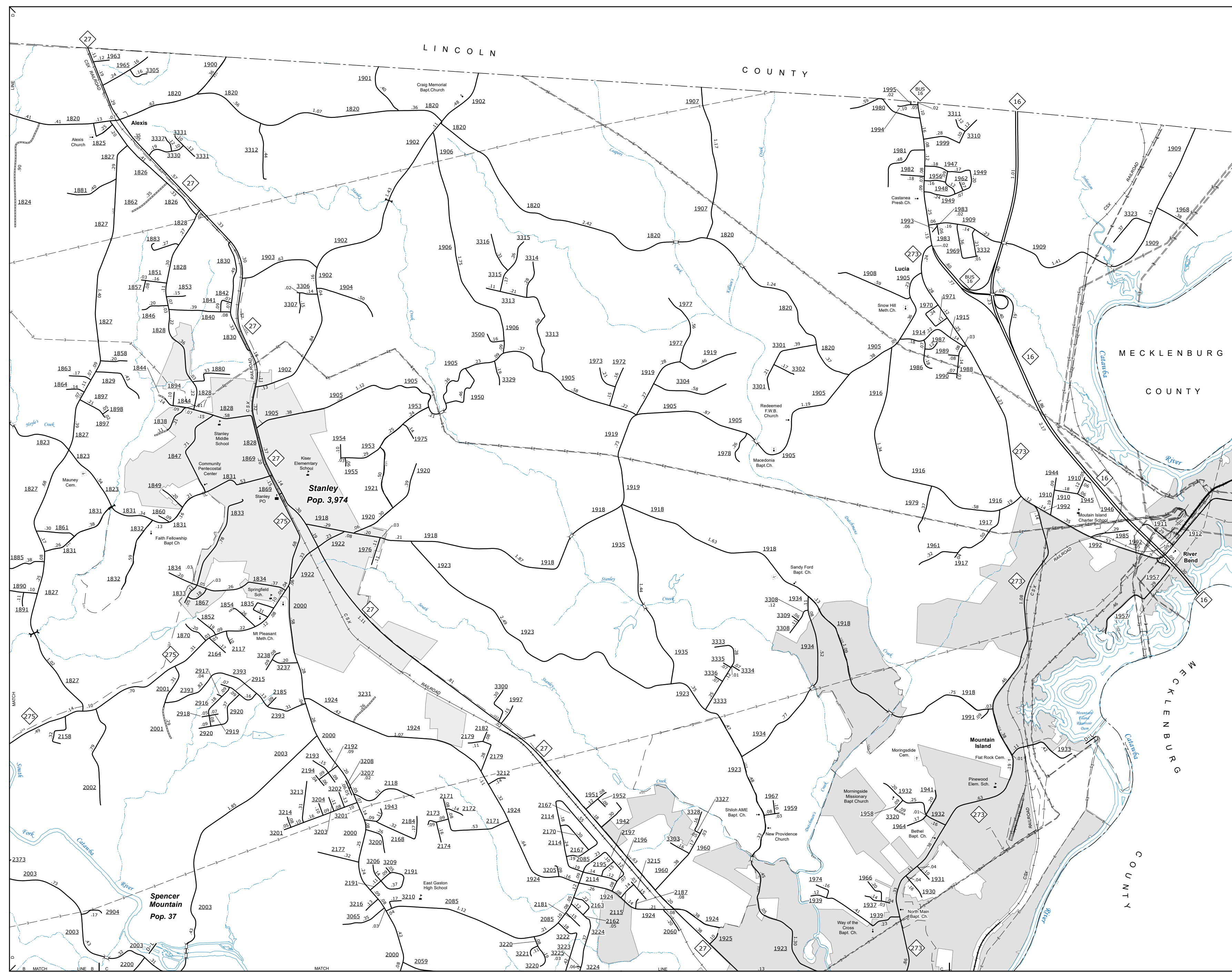
Stanley and Vicinity