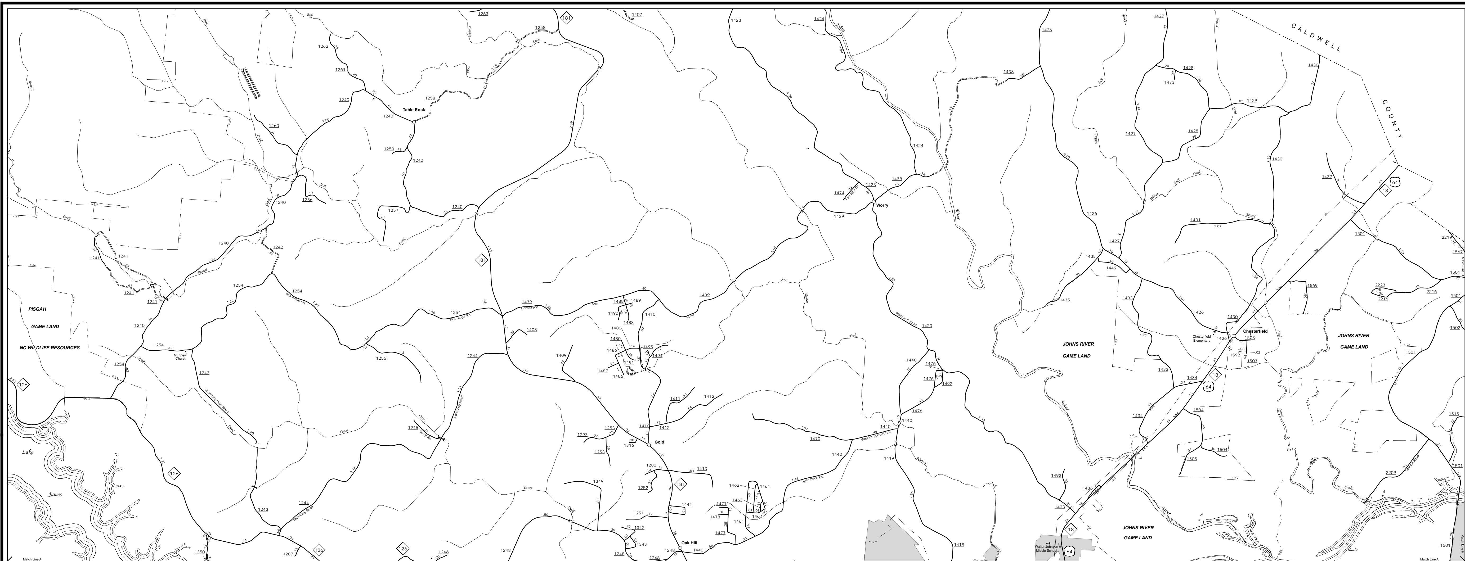
Oak Hill & Table Rock