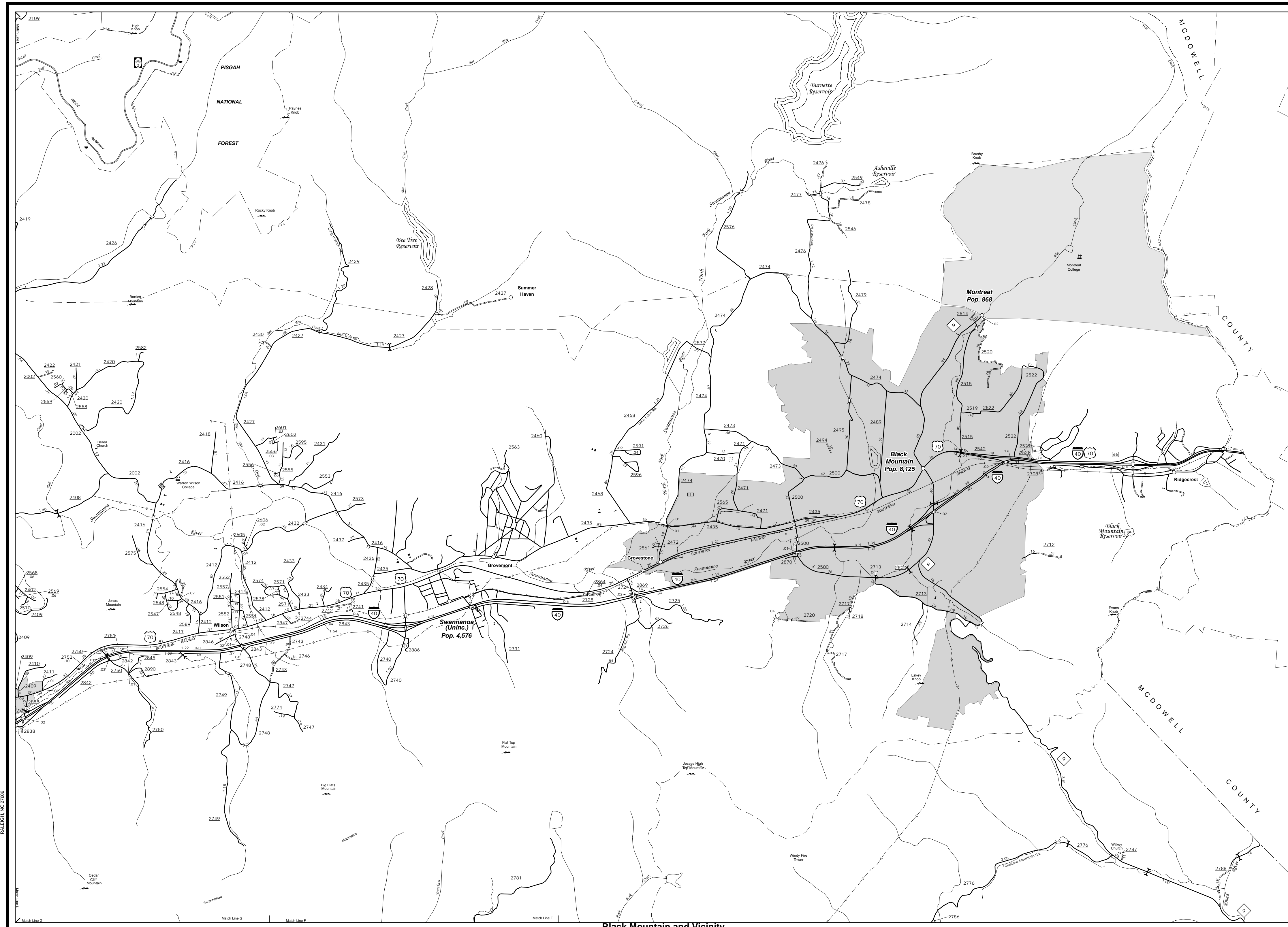
Black Mountain and Vicinity

COPIES OF THIS MAP ARE AVAILABLE FOR PURCHASE AT A PUBLIC NOMINAL COST. ADDRESS: N.C. DEPARTMENT OF TRANSPORTATION, MAU-MAPPING SECTION, 4801 BERNLIE RD., RALEIGH, NC 27606