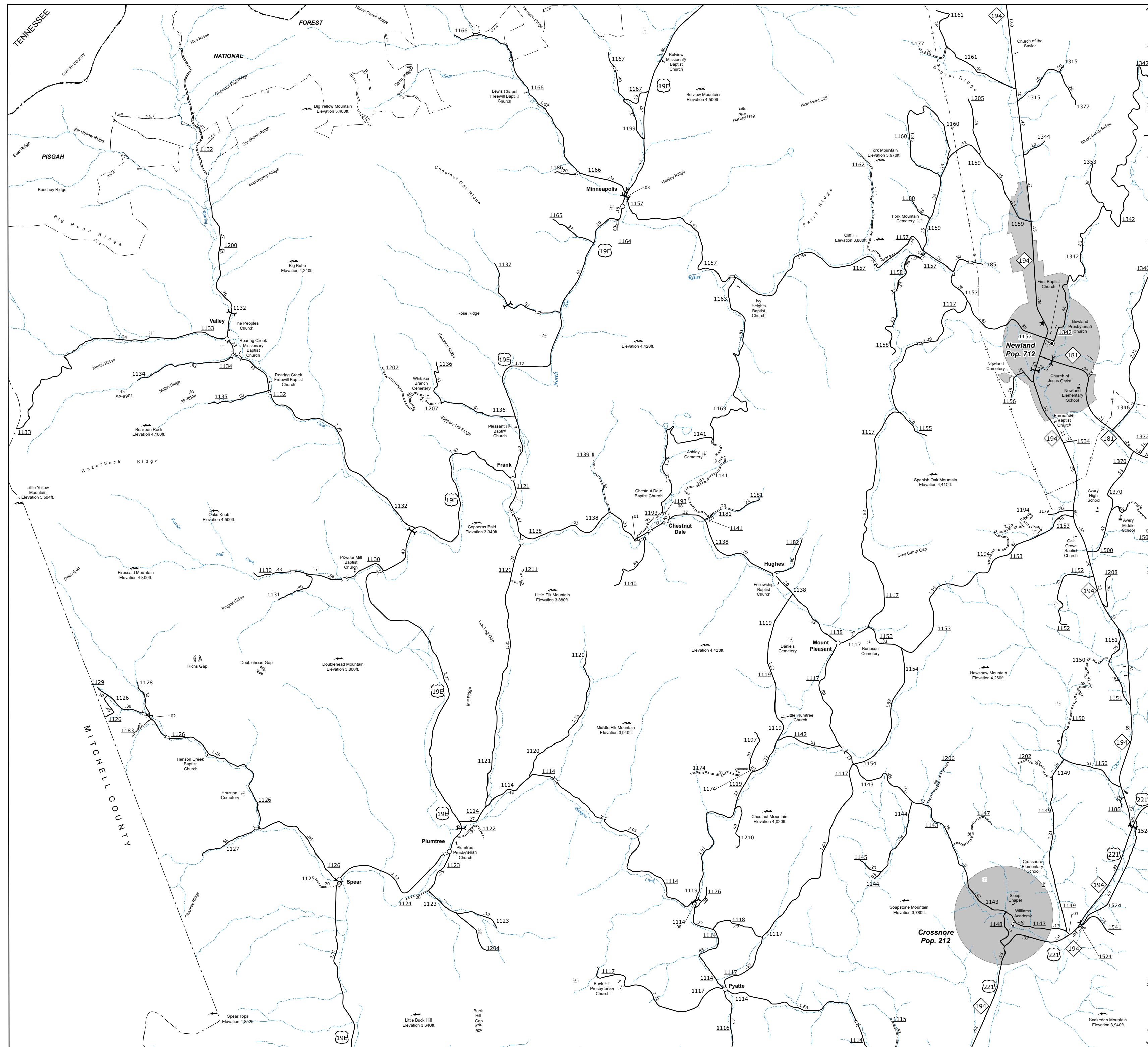
Newland & Crossnore

COPIES OF THIS MAP ARE AVAILABLE FOR PURCHASE AT A PUBLIC NOMINAL COST. ADDRESS: N.C. DEPARTMENT OF TRANSPORTATION, MS-AU, MAPPING SECTION, 6001 BERRY LANE, RALEIGH, NC 27606