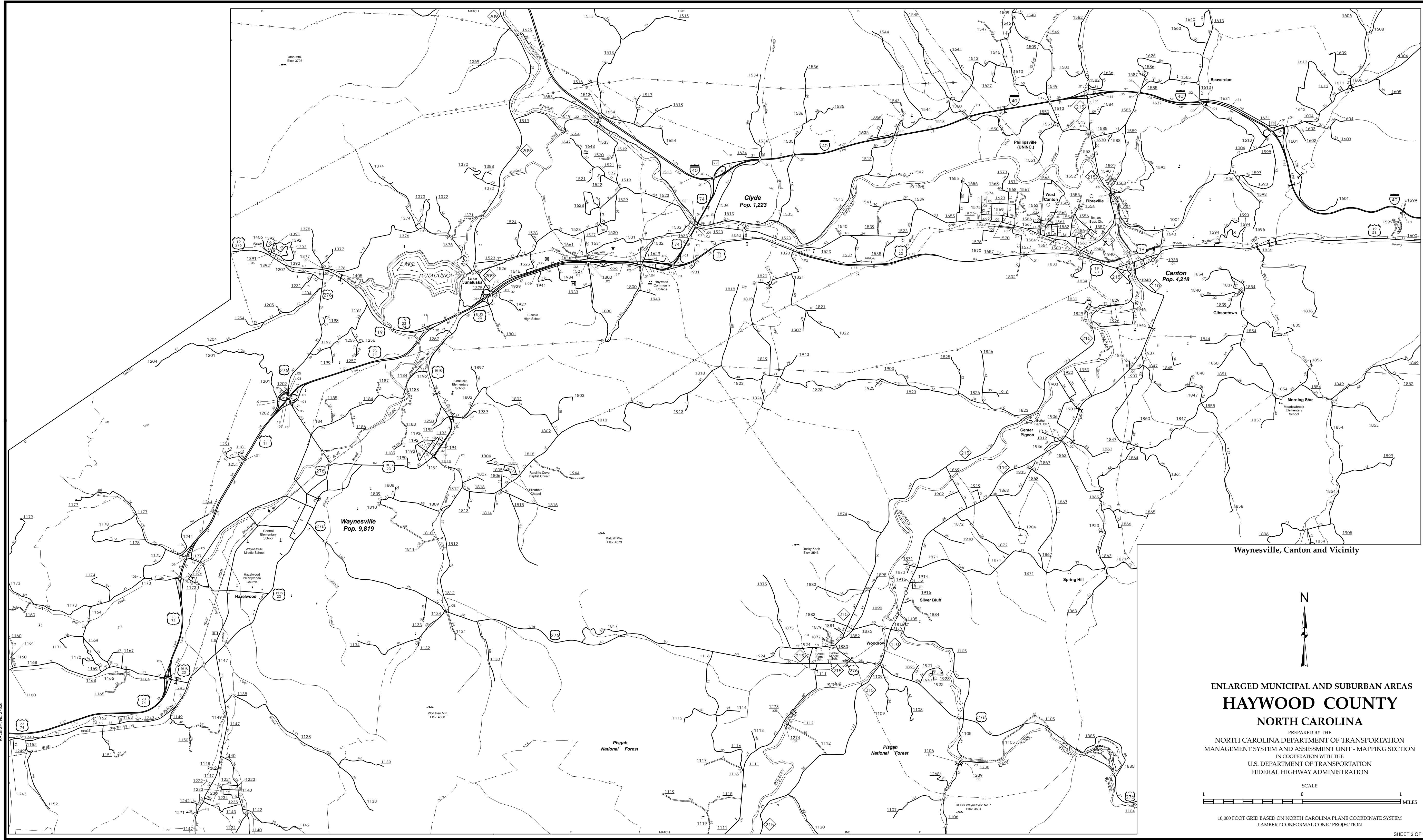
Waynesville, Canton and Vicinity

COPIES OF THIS MAP ARE AVAILABLE FROM THE N.C. DEPARTMENT OF TRANSPORTATION ADDRESS: MSAU-MAPPING SECTION 4809 BERT LEO COLUMBUS, NC 28608