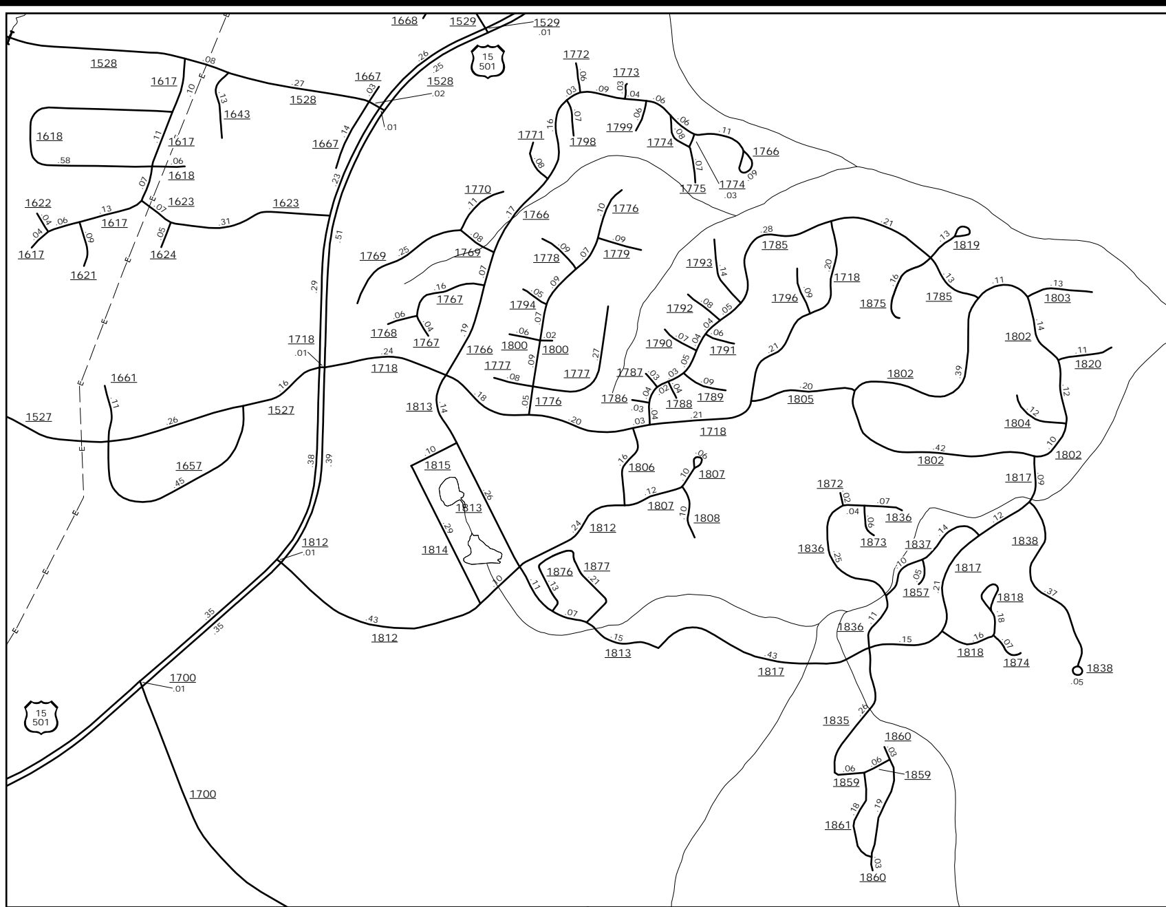
Bennet, Bonelee and Vicinity