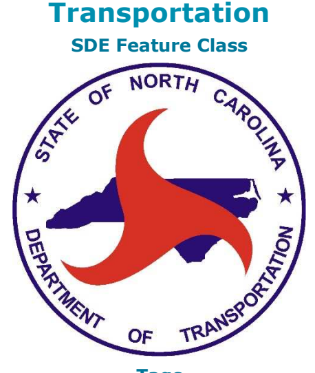
Tags Bridge, Pipe, Culvert, Bridge Maintenance Unit, SIP, SDV, Structures