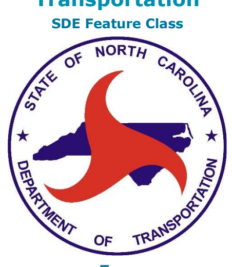
Tags Bridge, Pipe, Culvert, Bridge Maintenance Unit, SIP, SDV, Structures