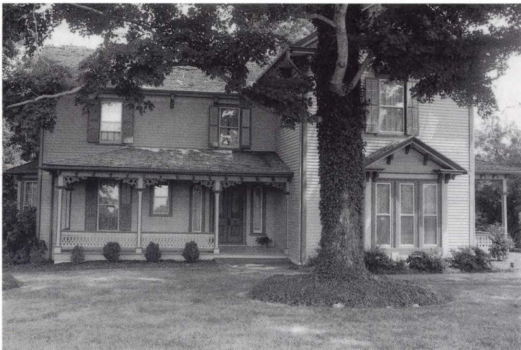
L. Banks Holt House