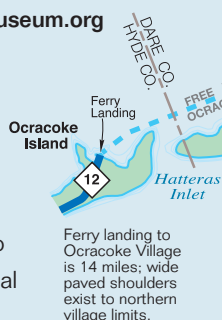
Ferry landing to Ocracoke Village is 14 miles; wide paved shoulders exist to northern village limits.

Graveyard of the Atlantic Museum — Outer Banks maritime history from 1524 to 1945 is documented, preserved, and exhibited in this museum in Hatteras Village. The museum encourages discovery and promotes understanding of the hundreds of known shipwrecks and artifacts discovered off the Outer Banks coast. The entrance to the museum itself uses wooden beams to portray the curves of typical ships found in the waters of the Outer Banks. Admission is free. (252) 986-2995. www.graveyardoftheatlantic.com